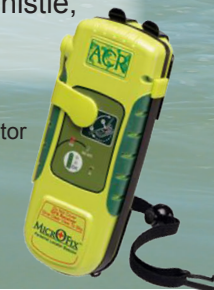
Personal Locator Beacon

A cold water immersion event is a fight for survival .