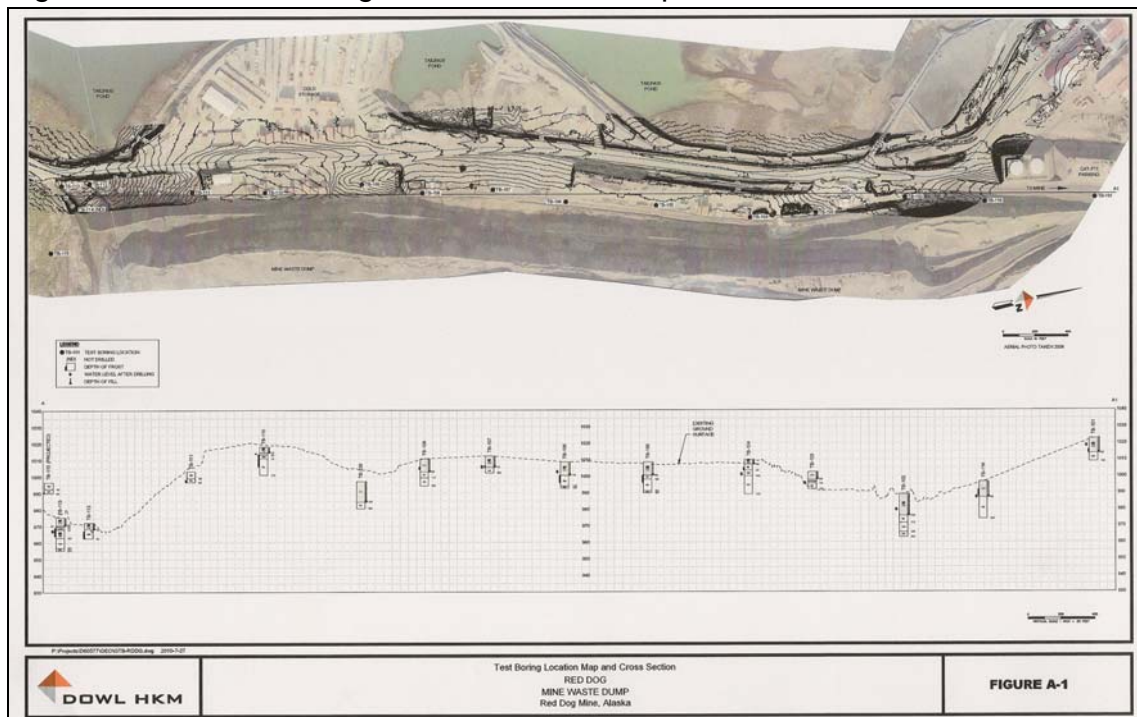
Figure1: DOWL HKM Auger Hole Location Map

The data required to meet the first three objectives was obtained by drilling a series of 15 holes along the base of the waste stockpile using a hollow stem auger. In each of the holes the overburden material was logged, and the condition of the bedrock was determined. In the eight holes that encountered groundwater, the groundwater elevation was measured.