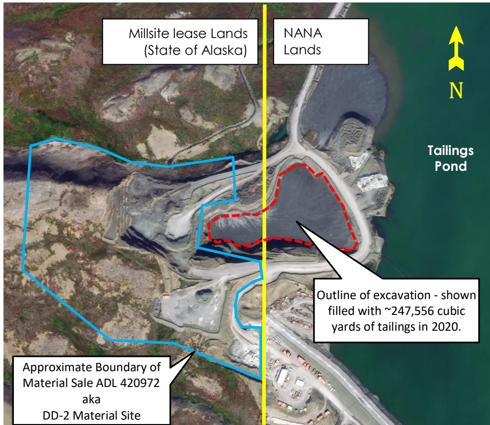
Figure 2. Detailed Location Map of Tailings Disposal Area and Existing DD-2 Material Site

Under the current Red Dog Mine Reclamation Plan Approval (F20169958), the TSF will receive a “wet” closure. The tailings will remain covered with at least two feet of water cover and that water pond will be maintained for the long-term following mine closure. The water cover is expected to reduce oxygen availability to the tailings and slow their oxidation. To reduce the potential for fugitive dust and reduce water infiltration onto the tailings, until the TSF water level submerges the tailings, the mine will place a layer of DD2 quarry material on top of the tailings. This area will also be used as a laydown location to place non-construction grade DD2 material, which will further reduce water infiltration onto the tailings and reduce oxygen availability to the tailings and slow their oxidation until they are submerged by TSF water.