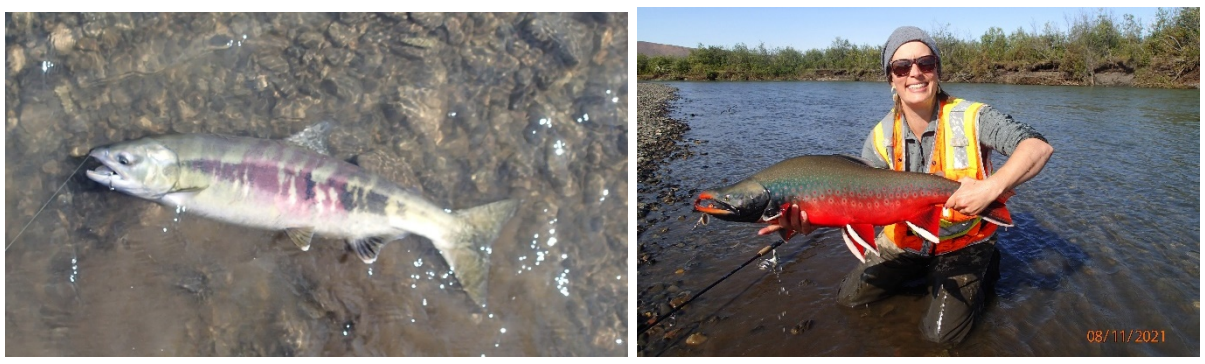
Figure 4. Chum salmon (left) and Dolly Varden (right) caught on Ikalukrok Creek.

On August 12<sup>th</sup> we drove the road from Red Dog Mine to the port, and inspected bridges and culverts along the way. The systems in place to prevent dust and silt from washing into creeks and bridges were all in good condition and functioning well, even after the extremely heavy rains in late July. The combination of silt fencing directing runoff away from the creeks on either side of each bridge and the corrugated sheet metal that forms a barrier on the bridge railings appeared to be effective in keeping road runoff out of the water bodies (Figure 5).