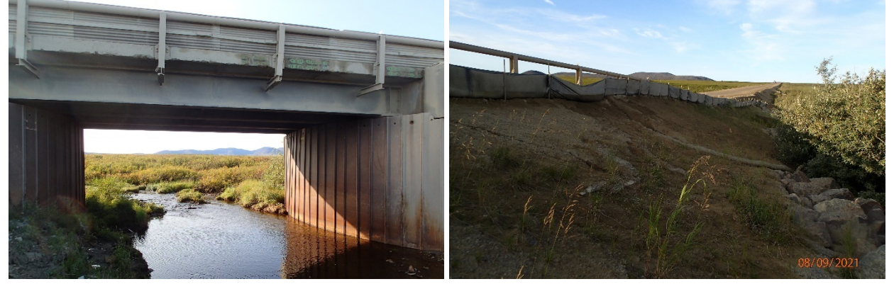
Figure 5. The bridge over Little Creek with metal sheeting in place to prevent road runoff on the bridge (left), and silt fencing directing runoff away from Anxiety Ridge Creek (right).

On August 12<sup>th</sup> we drove the road from Red Dog Mine to the port, and inspected bridges and culverts along the way. The systems in place to prevent dust and silt from washing into creeks and bridges were all in good condition and functioning well, even after the extremely heavy rains in late July. The combination of silt fencing directing runoff away from the creeks on either side of each bridge and the corrugated sheet metal that forms a barrier on the bridge railings appeared to be effective in keeping road runoff out of the water bodies (Figure 5).