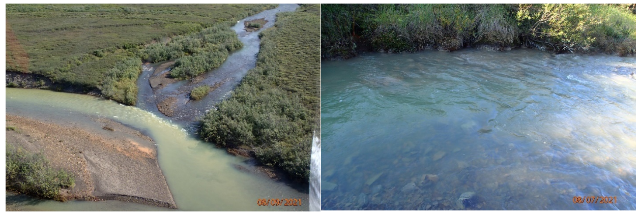
Figure 3. The mouth of Red Dog Creek on Ikalukrok Creek (left). Red Dog Creek is the clearer creek entering from the right. Turbid water on lower Competition Creek (right).