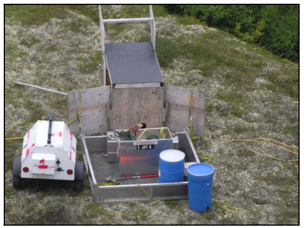
Figure 4: Water pump for Drill Rig # 8.