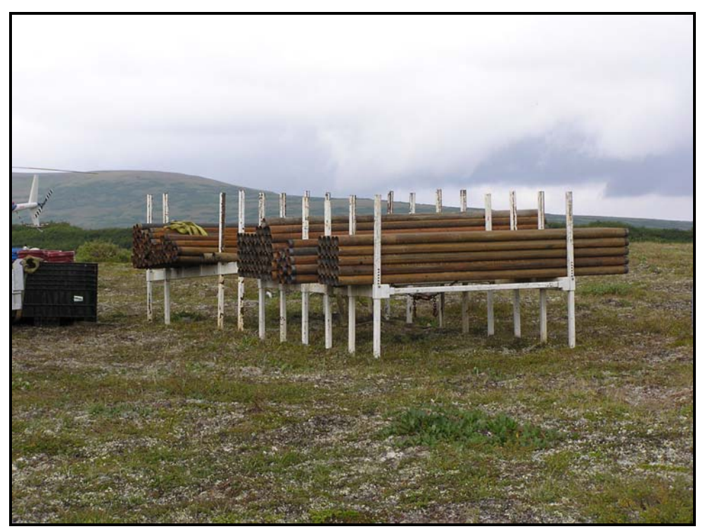
Figure 22: Sections of drill pipe on racks.