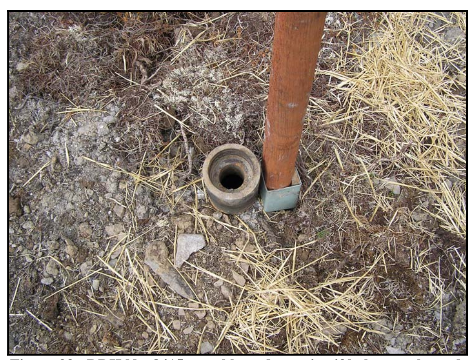
Figure 33: DDH No. 8415 - unable to determine if hole was plugged.