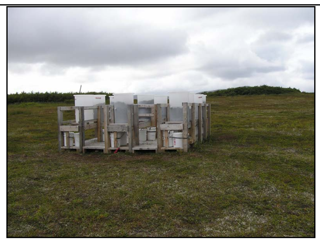
Figure 34: Geochemical barrel testing station.