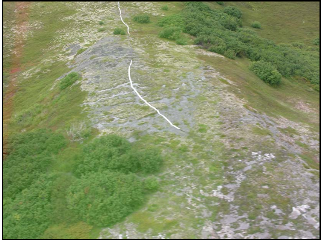
Figure 10: Discharge location for Drill Rig # 2.