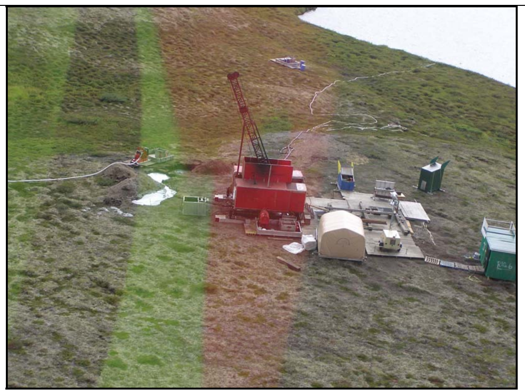
Figure 19: Drill Rig # 6 with water source in background.