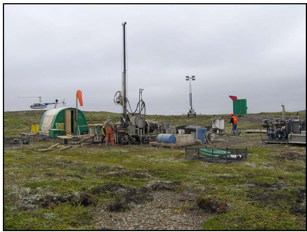
Figure 3: Drill Rig # 8.