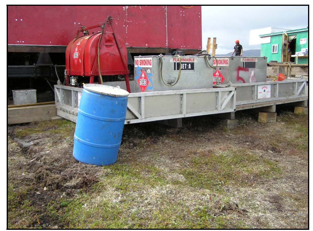
Figure 17: Fuel storage for Rig # 5.