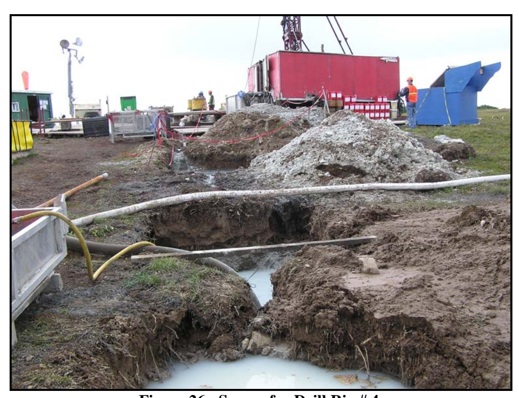
Figure 26: Sumps for Drill Rig # 4.