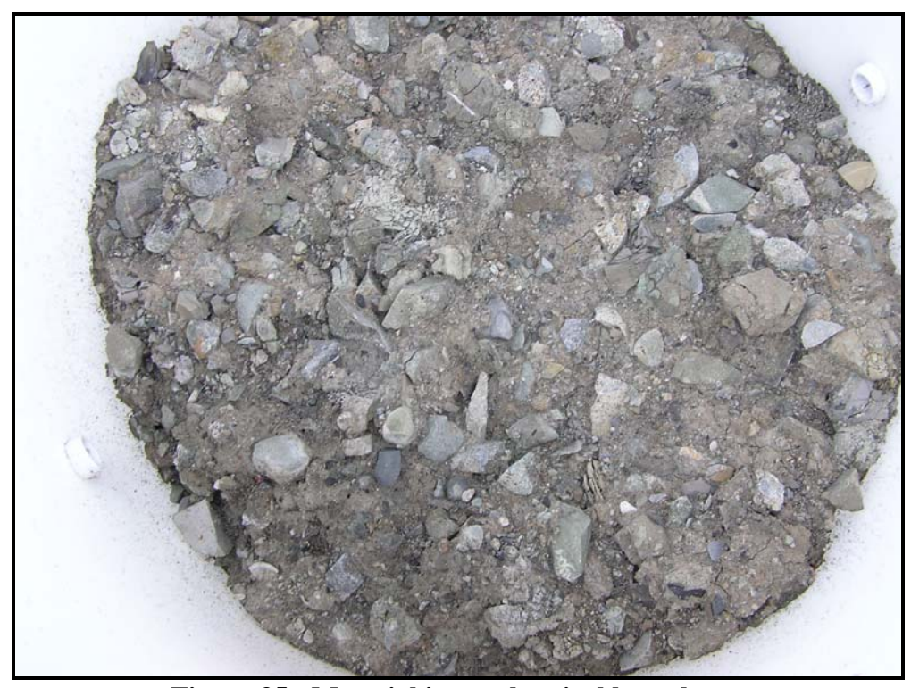
Figure 35: Material in geochemical barrel test.