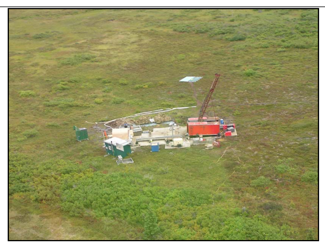
Figure 9: Drill Rig # 2 at drill hole number 8423.