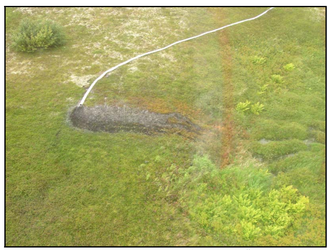
Figure 18: Discharge point for Drill Rig # 5.