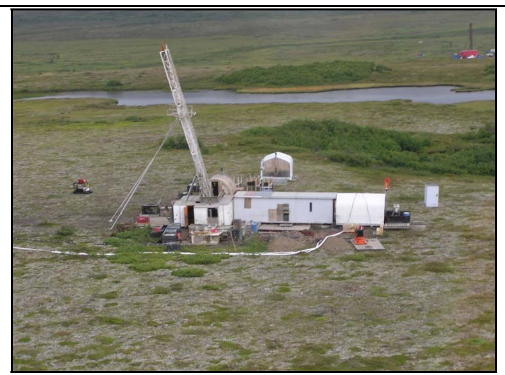
Figure 21: Drill Rig # 1 on drill hole No. 8422.