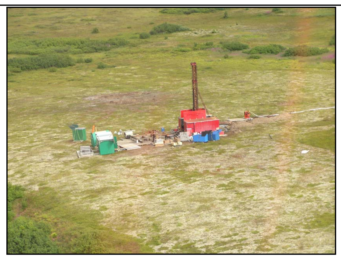
Figure 15: Drill Rig # 5 on drill hole No. 8420.