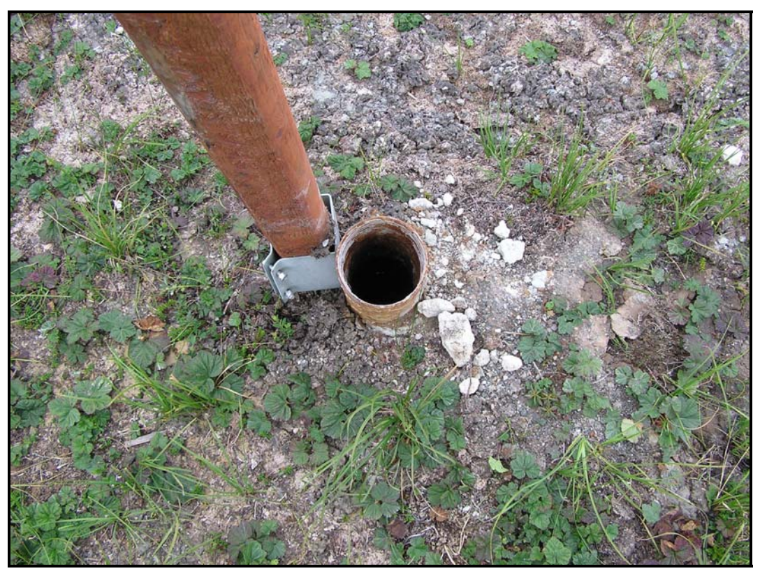
Figure 31: Open casing for DDH # 8405; unable to determine if hole had been plugged.