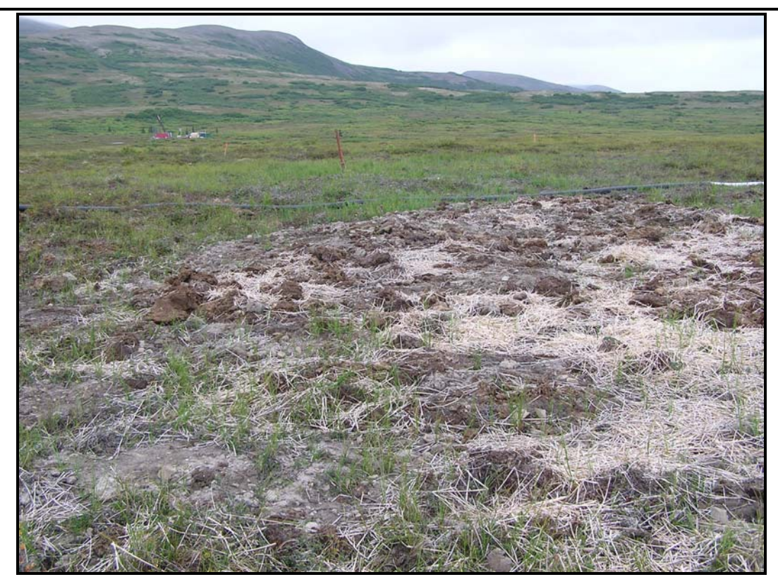
Figure 30: Reclaimed site of DDH # 8405.