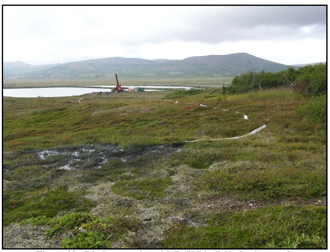
Figure 20: Discharge point with Drill Rig # 6 in background.