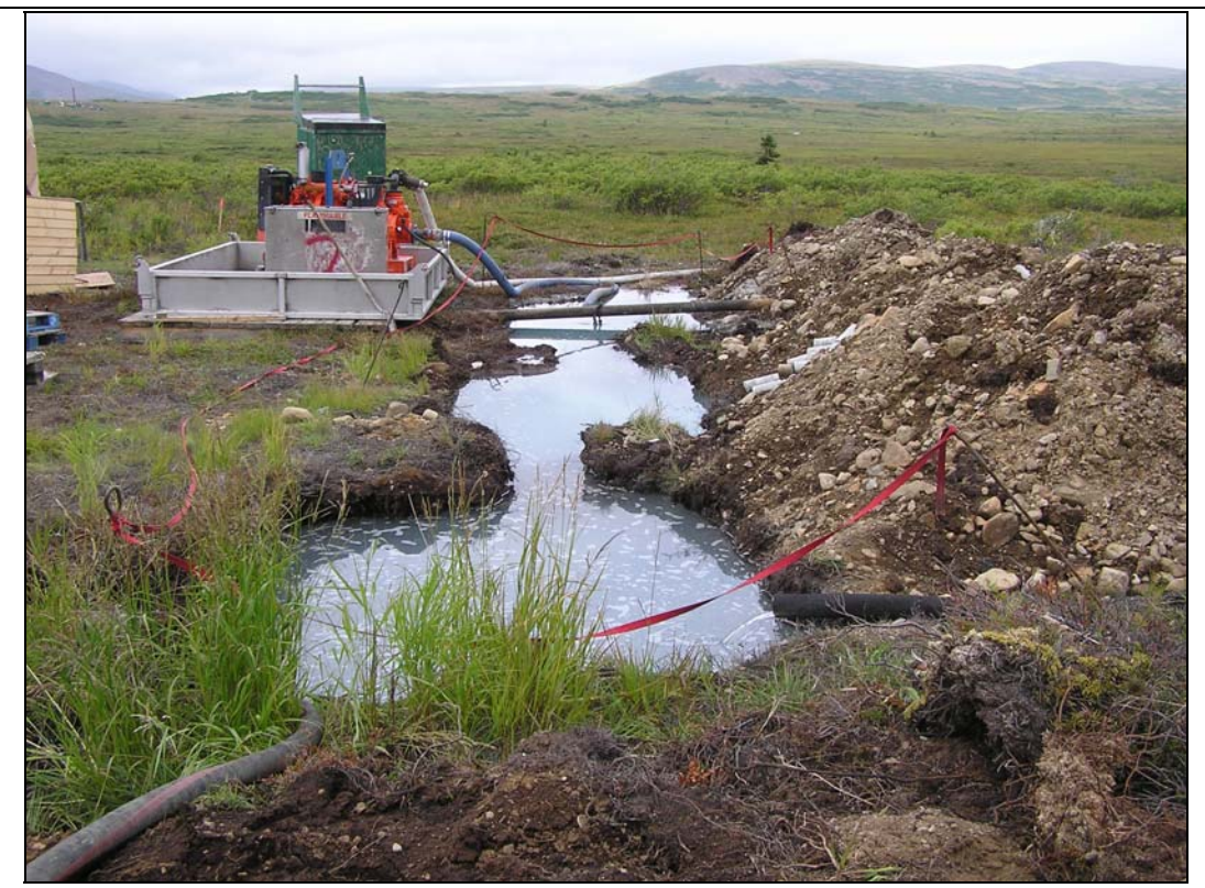
Figure 13: Sumps at Drill Rig # 2.