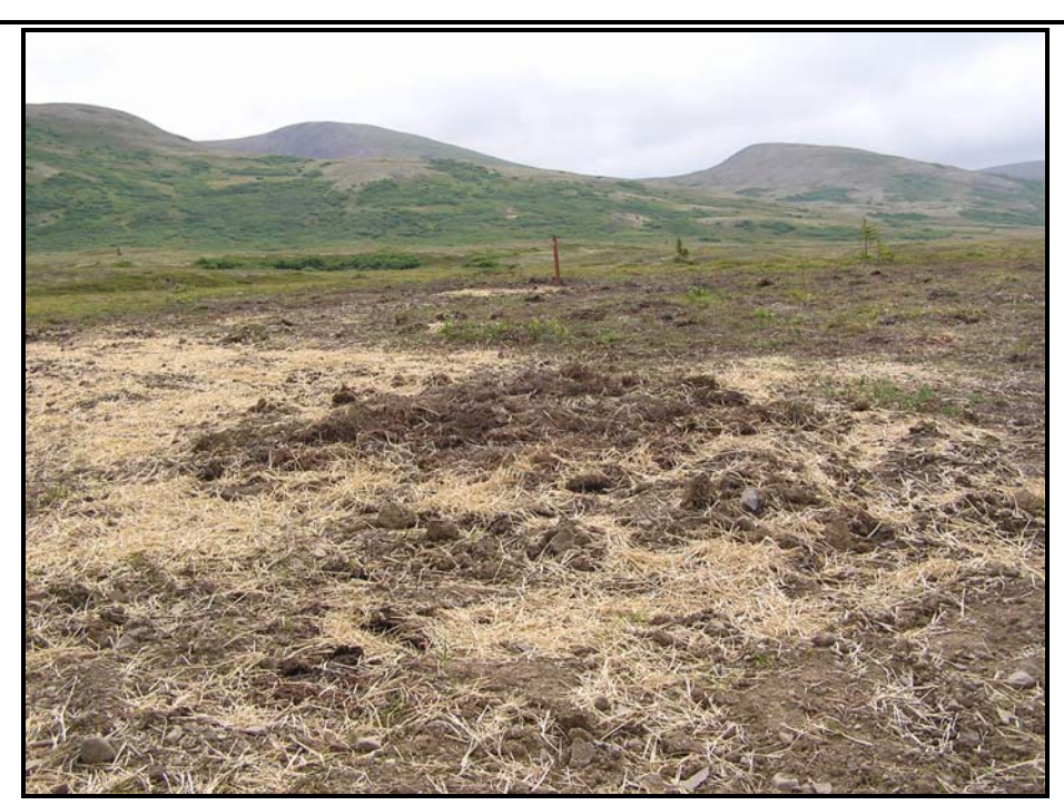
Figure 32: Reclaimed drill site for hole No. 8415.

DDH-8415 site was observed near Drill Rig # 5. The site was free of litter and debris. The disturbed area had straw mulch. The drillhole casing extended above the ground surface approximately one foot. It was not possible to determine whether or not this drill hole had been plugged.