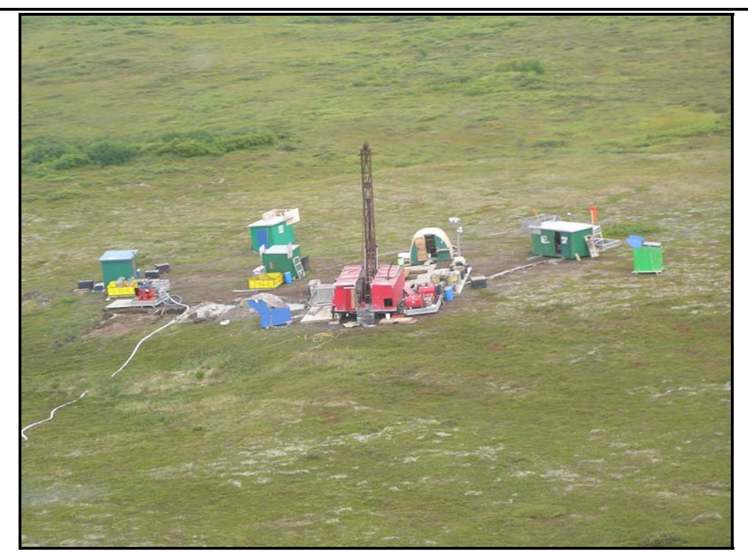
Figure 25: Drill Rig # 4 on hole No. 8417.