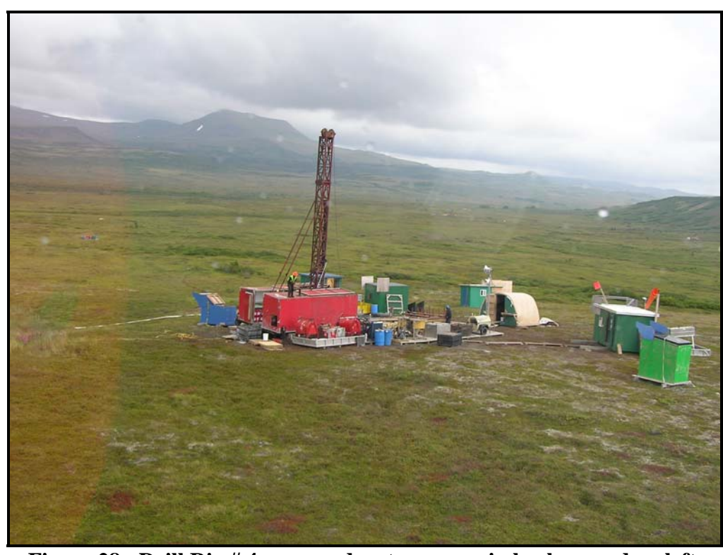
Figure 28: Drill Rig # 4; assumed water source in background on left.