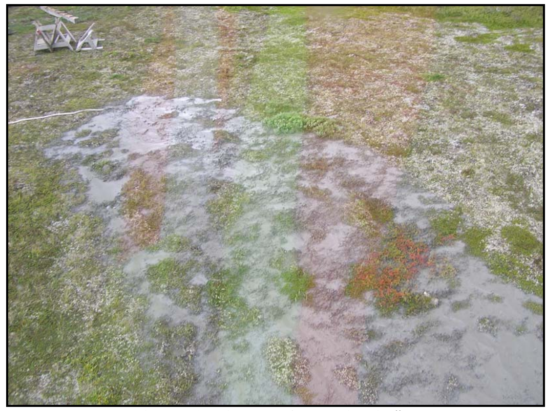
Figure 24: Discharge from Drill Rig # 1.