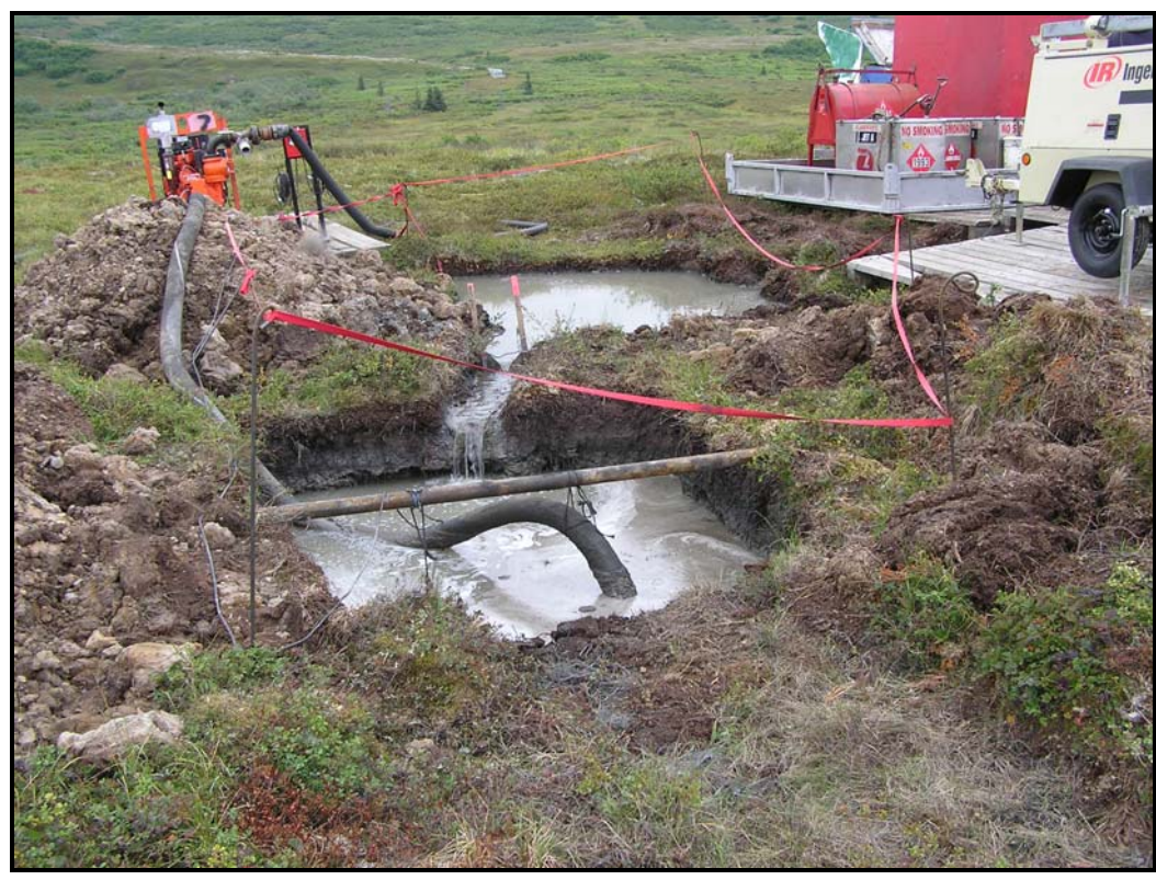
Figure 6: Primary and secondary sumps at Drill Rig # 3.