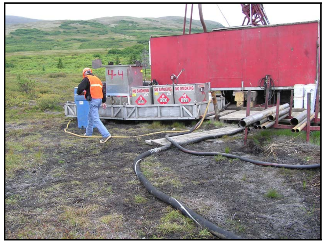
Figure 12: There was a slight fuel odor near the fuel tanks for Drill Rig # 2 and a little staining on the ground.