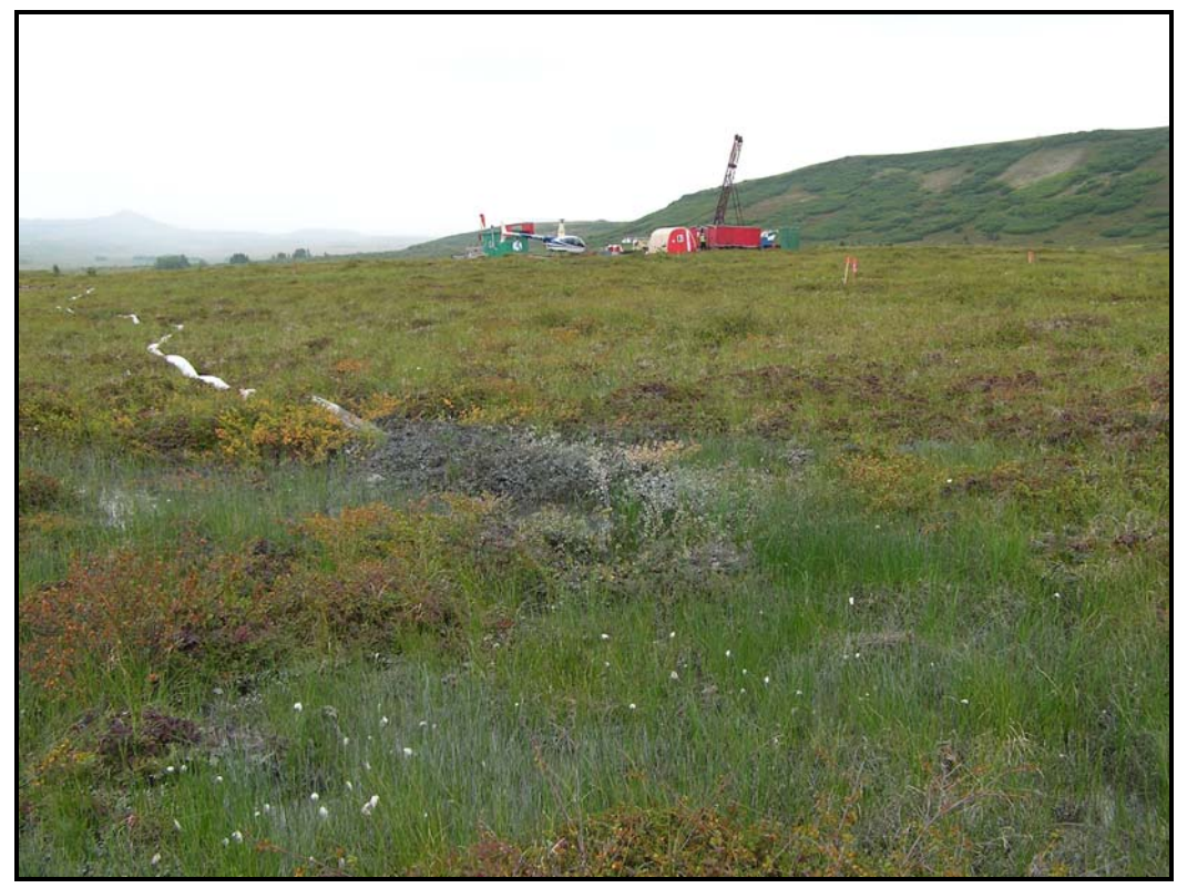
Figure 8: Discharge location for Drill Rig #3 (Rig # 3 in background).