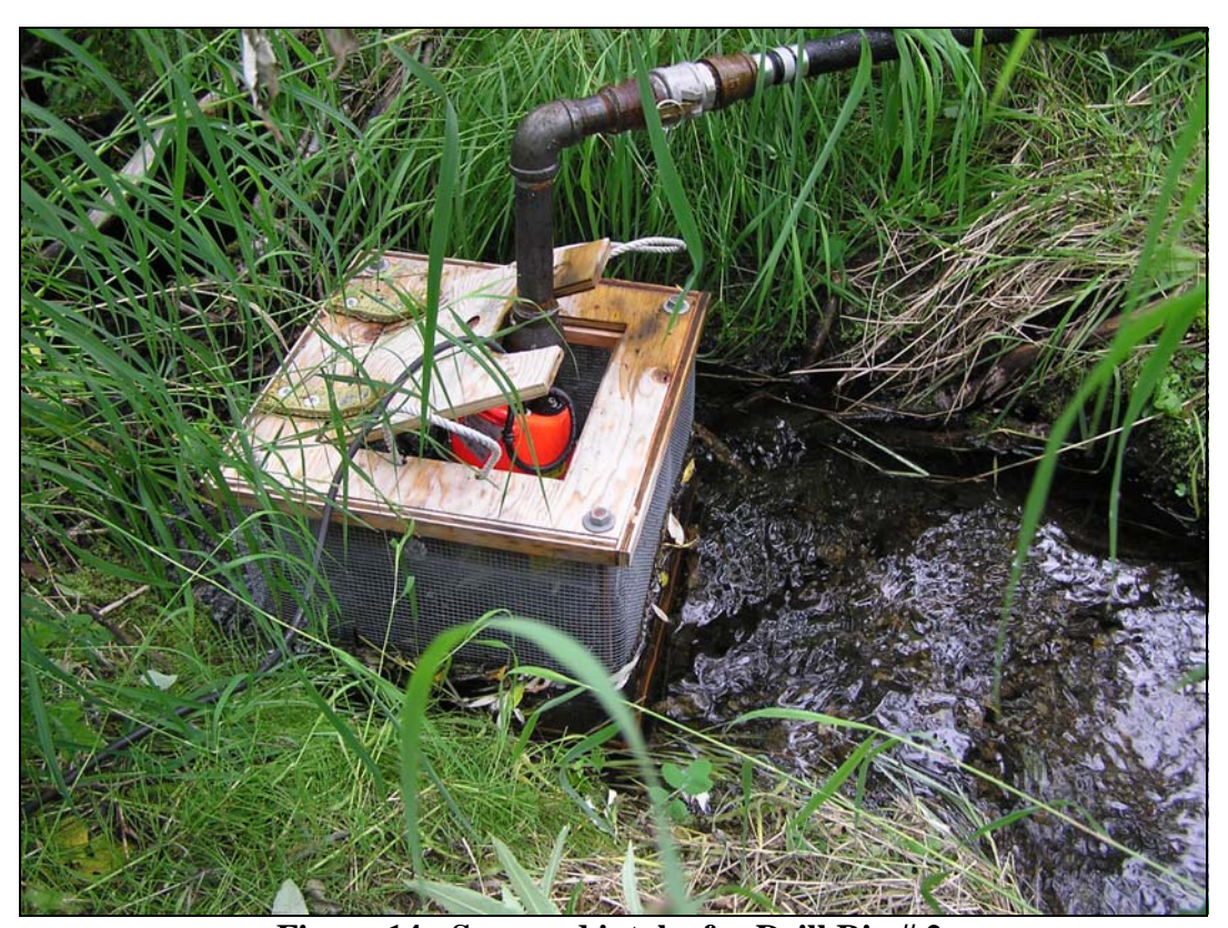
Figure 14: Screened intake for Drill Rig # 2.