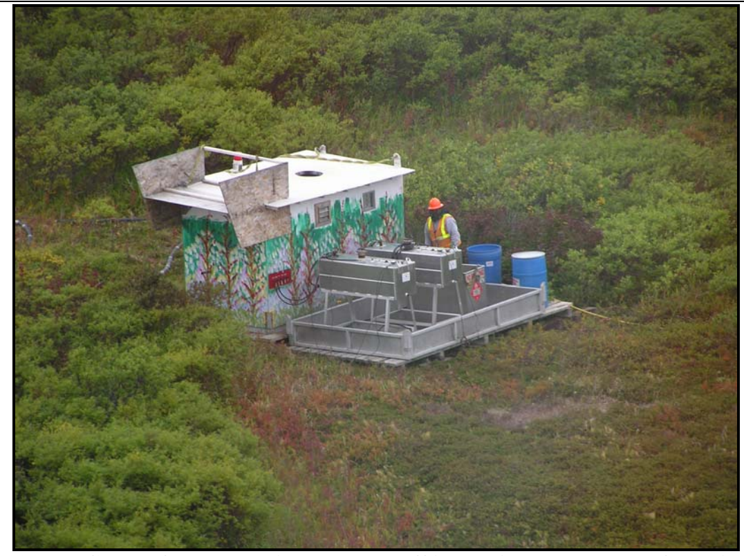
Figure 11: Bud Green of Pebble environmental staff inspecting water source for Drill Rig # 2.