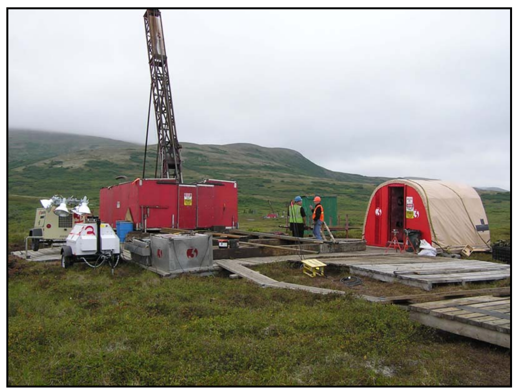
Figure 5: ADEC inspecting Drill Rig # 3.