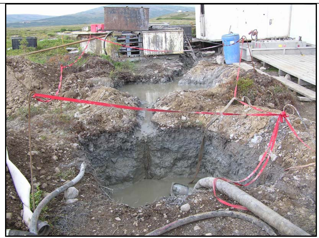
Figure 23: Sumps at Drill Rig # 1.