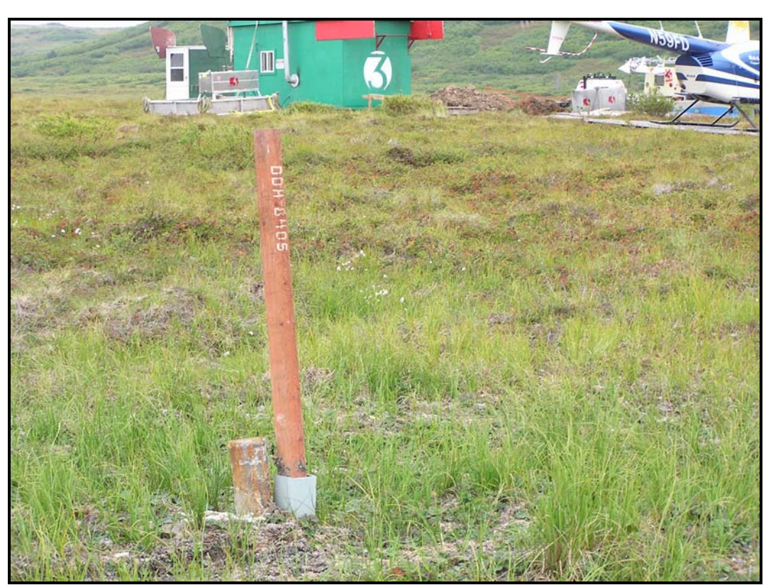
Figure 29: Reclaimed site - DDH #8405.

DDH-8405 site was observed near Drill Rig # 3. The site was free of litter and debris. The disturbed area had straw mulch. The drillhole casing extended above the ground surface approximately one foot. It was not possible to determine whether or not this drill hole had been plugged.