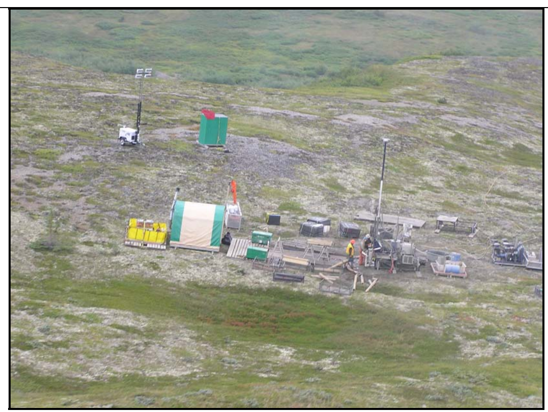
Figure 1: Drill Rig #8 - Geotechnical drilling rig at hole number P-08-87.