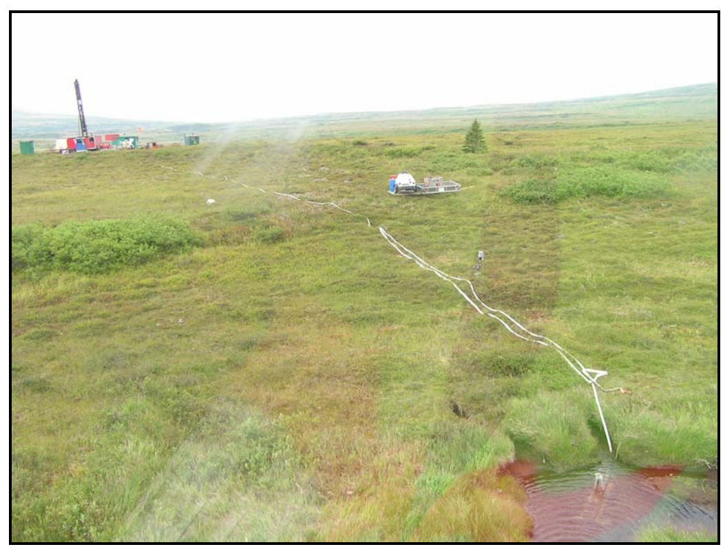
Figure 7: Source water pump with generator & Drill Rig # 3 in background.