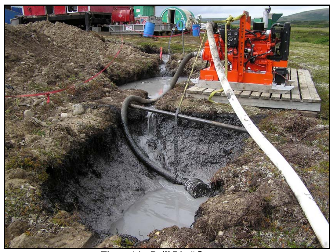
Figure 16: Drill Rig # 5 sumps.