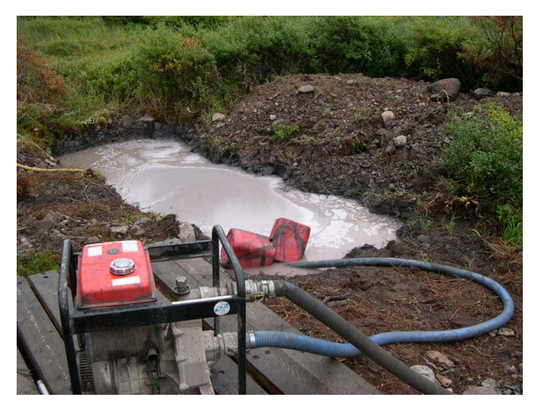
Figure 4. Settling pond at drill site.