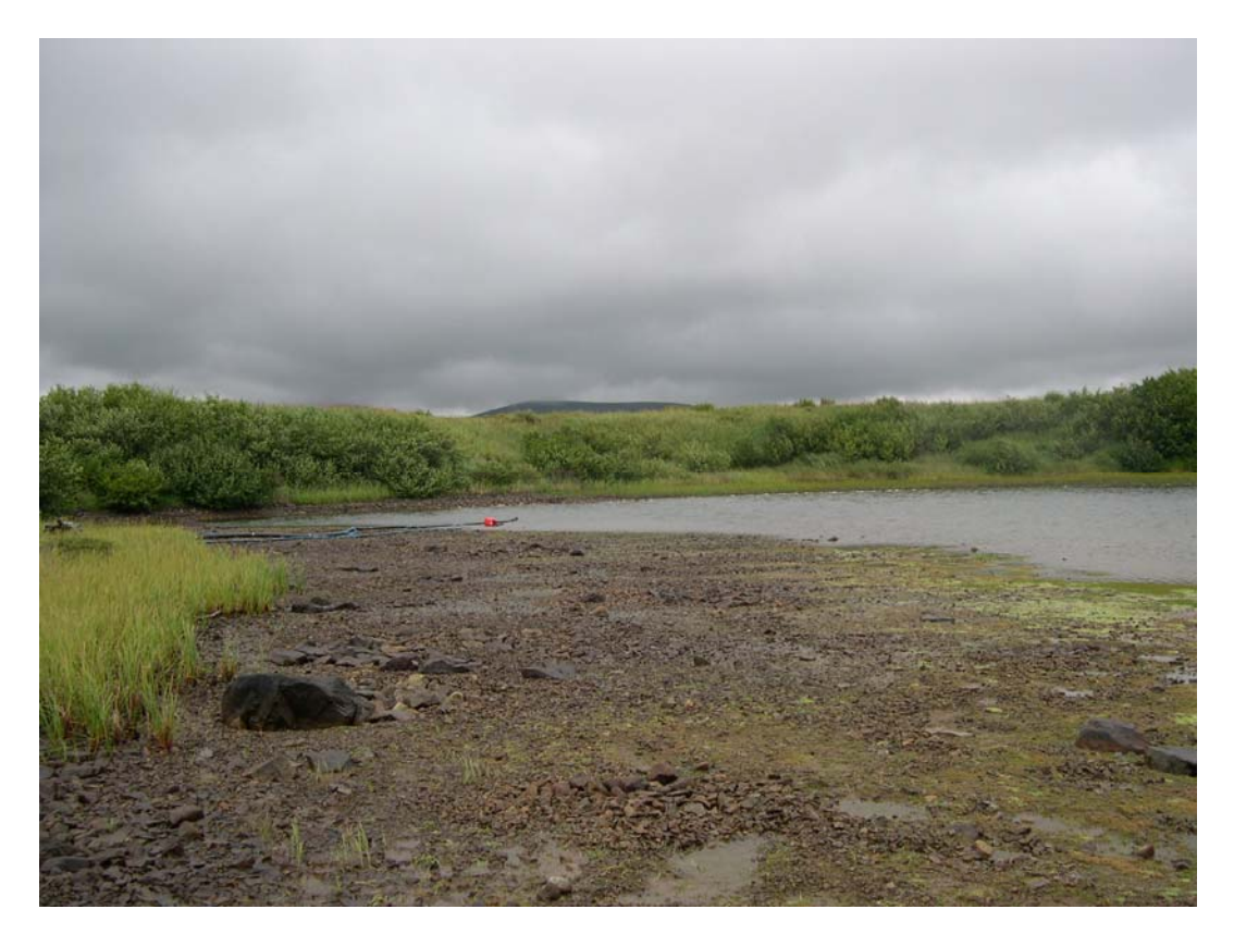
Figure 6. Primary water source and observed drawdown.