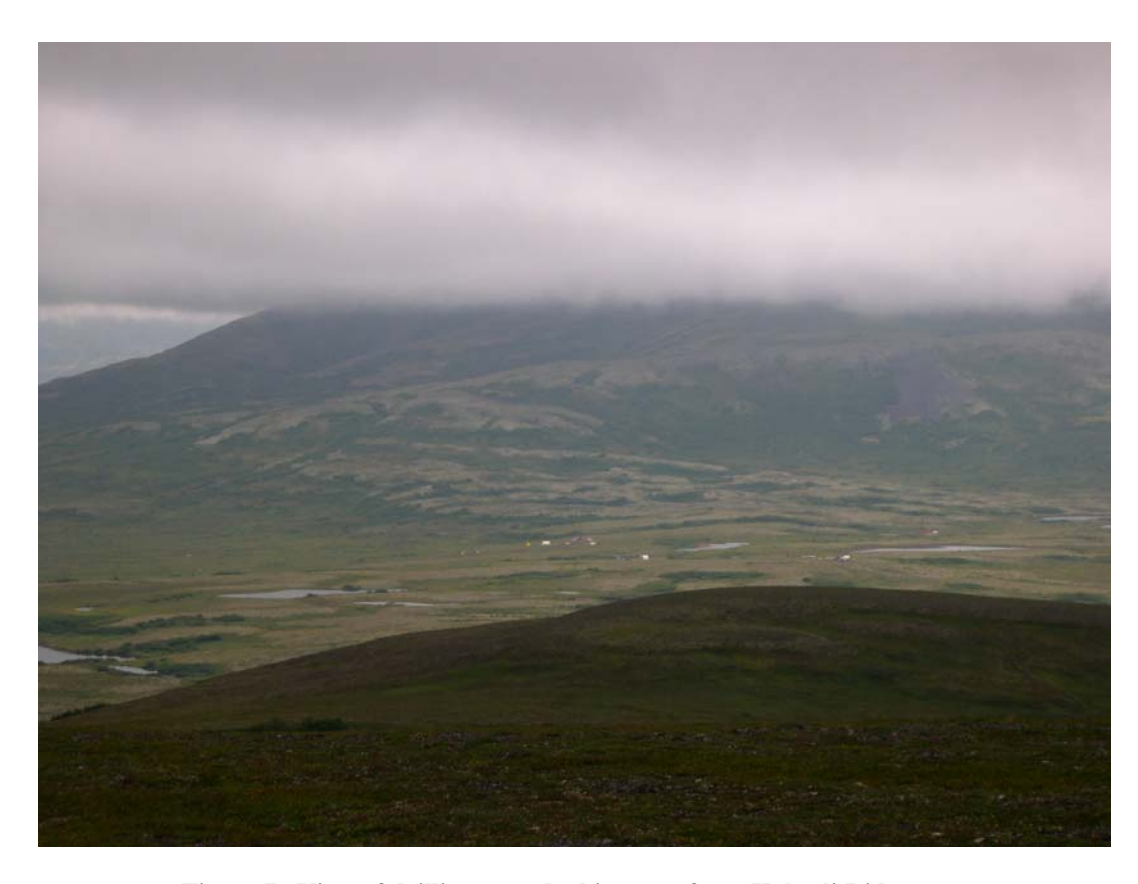
Figure 7. View of drilling area, looking east from Koktuli Ridge.