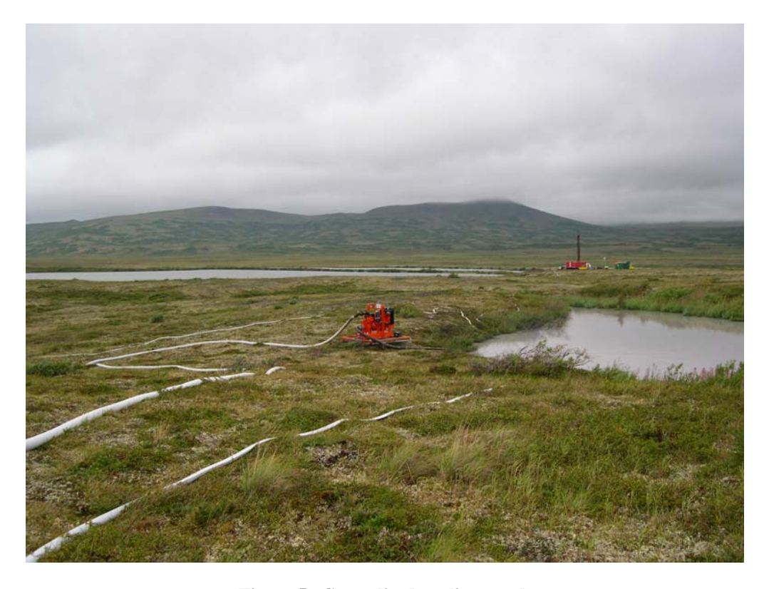
Figure 5. Centralized settling pond.