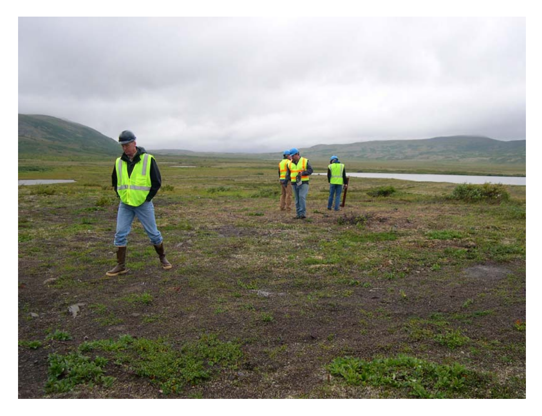
Figure 3. Location of previous drilling site.