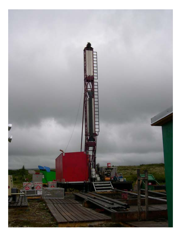
Figure 2. Visited drilling rigg and pad.