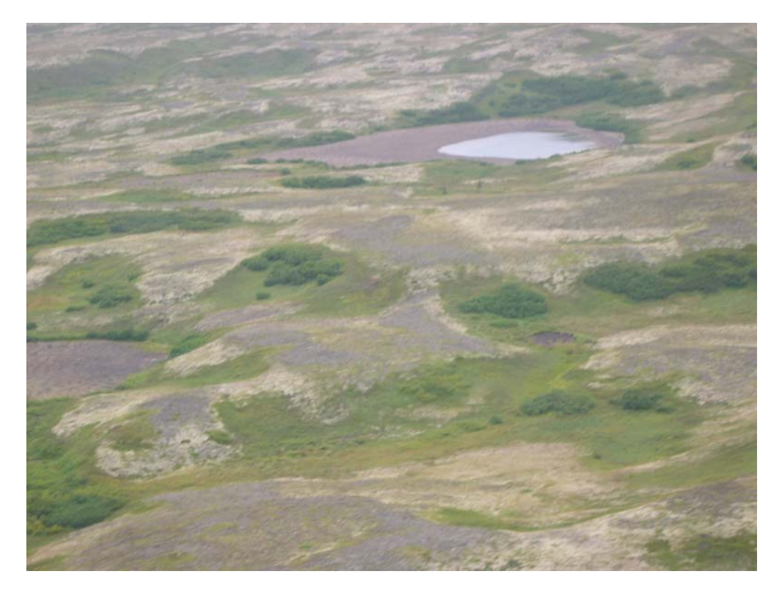
Figure 8. Typical observed kettle lake unaffected by exploratory drilling showing low water level.