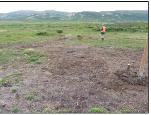
DDH 9462 site showing path of artesian flow and reclamation efforts.