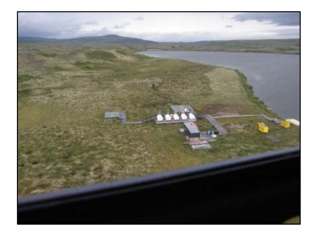
Fuel station for exploration activities.