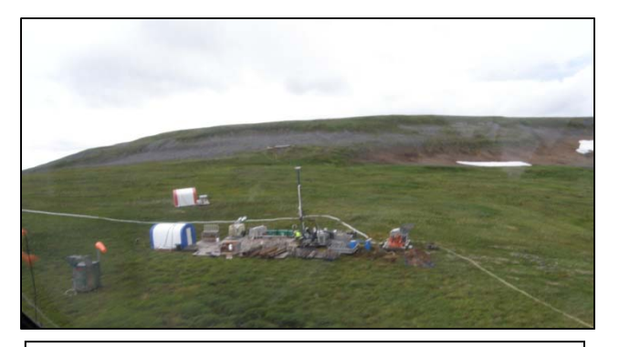
View of site for GH13374