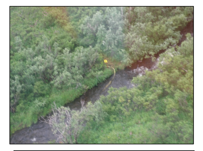
Stream and water take point location.