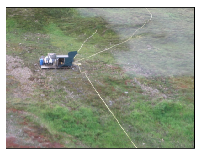
Pump for water is located uphill from the stream.