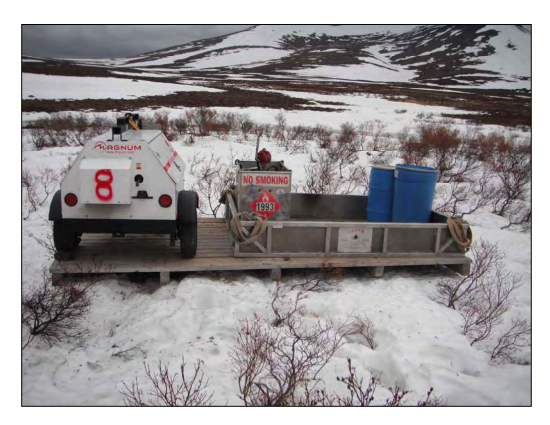
Figure 15. Fuel and generator used for water pump.