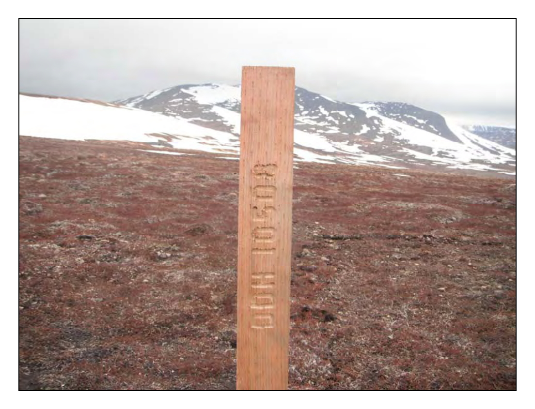
Figure 18. Sign post for reclaimed drill hole 10508.