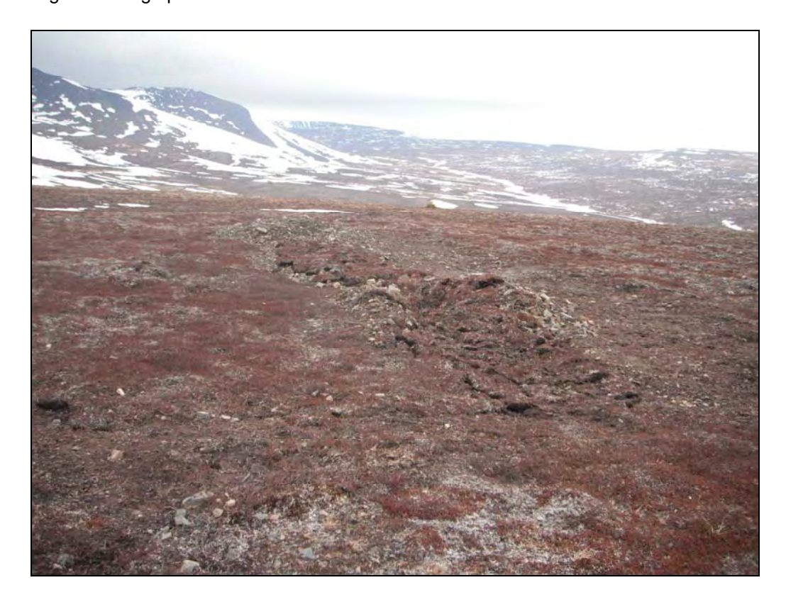
Figure 19. Reclaimed sump pit location. This site was completed in the Fall of 2010 and has not had a complete growing season.