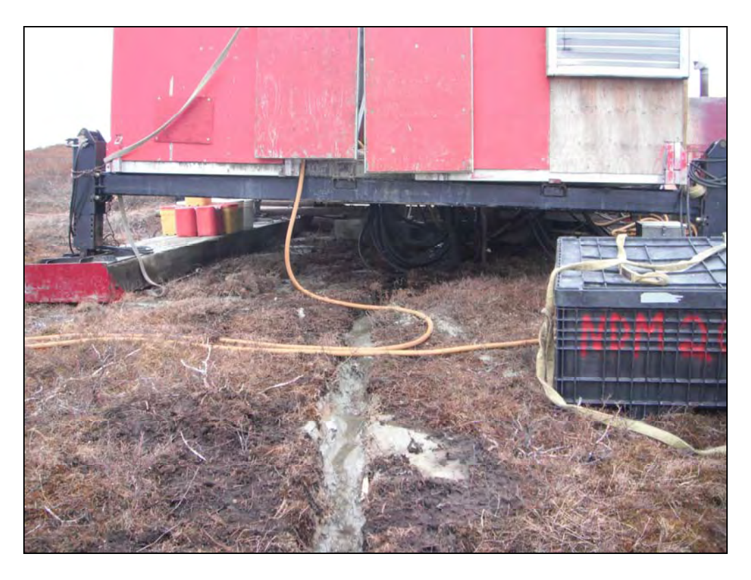
Figure 11. Trench transferring drill water from drill hole to the series of sump pits for settling out and recirculation.