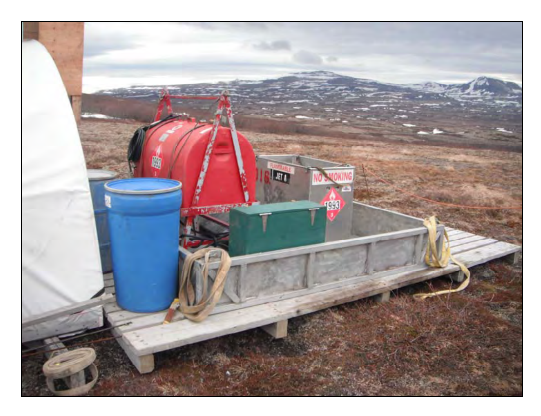
Figure 5. Fuel storage in catch basin on tundra pad, with spill kit and scrubbers (blue bin).