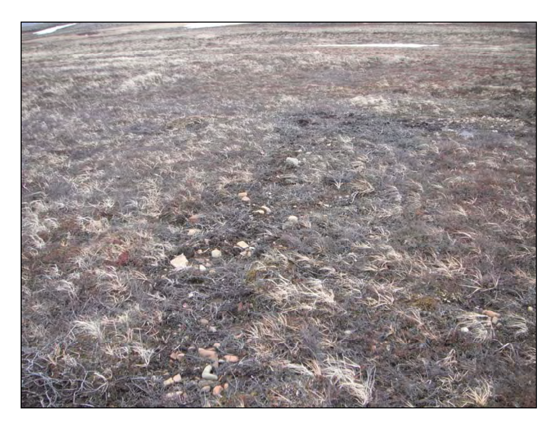
Figure 22. Reclaimed sump pit. This was a 2009 drill site and this has had a complete summer of regrowth/settlement.