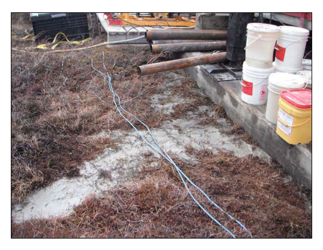
Figure 13. Presence of drill water on tundra adjacent to storage location of additives. This appeared to be overflow from the trench between drill hole and sump pits.