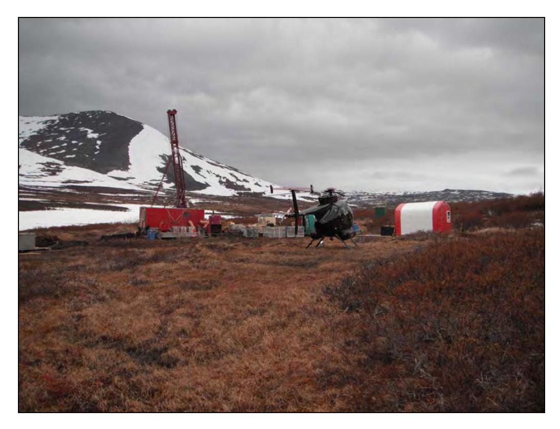
Figure 10. Drill rig # 3 on site of DDH 11528.

Other Comments: Areas of overflow/seepage near drill hole and from trench.