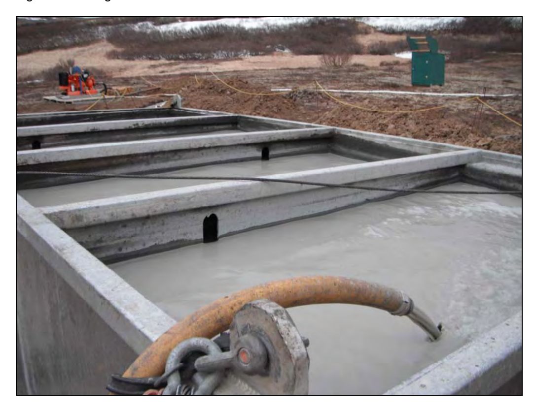
Figure 2. Recirculation tank in use. Drill water from final sump pit is recirculated back to drill for reuse.