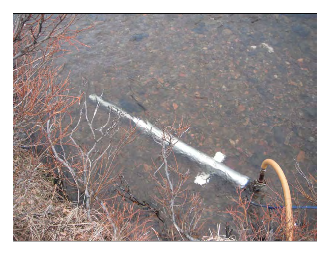
Figure 17. Screened water intake submerged in creek.