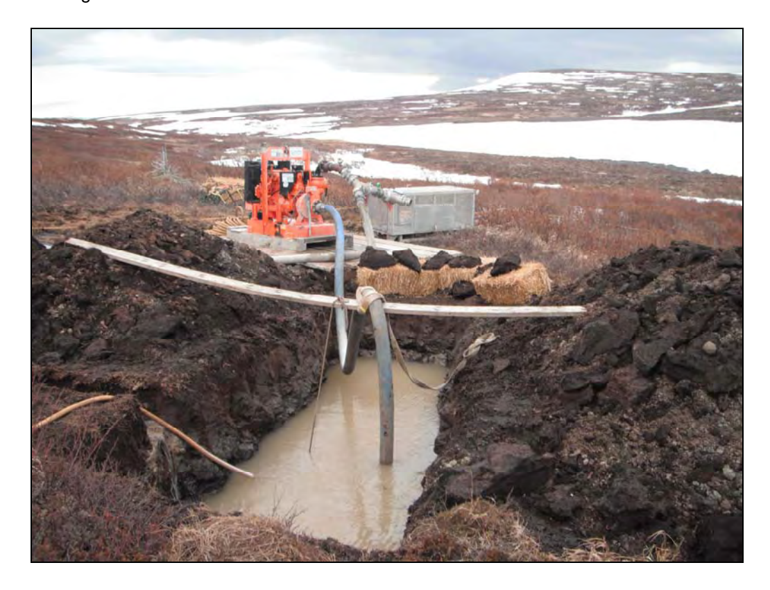
Figure 12. View of the final sump pit in a series of 3 pits. Muck and soil are stock piled on both sides of the sump pit for use in reclamation of the site. Straw bales are in place down gradient as a preventative measure should there be any overflow from the sump pit.