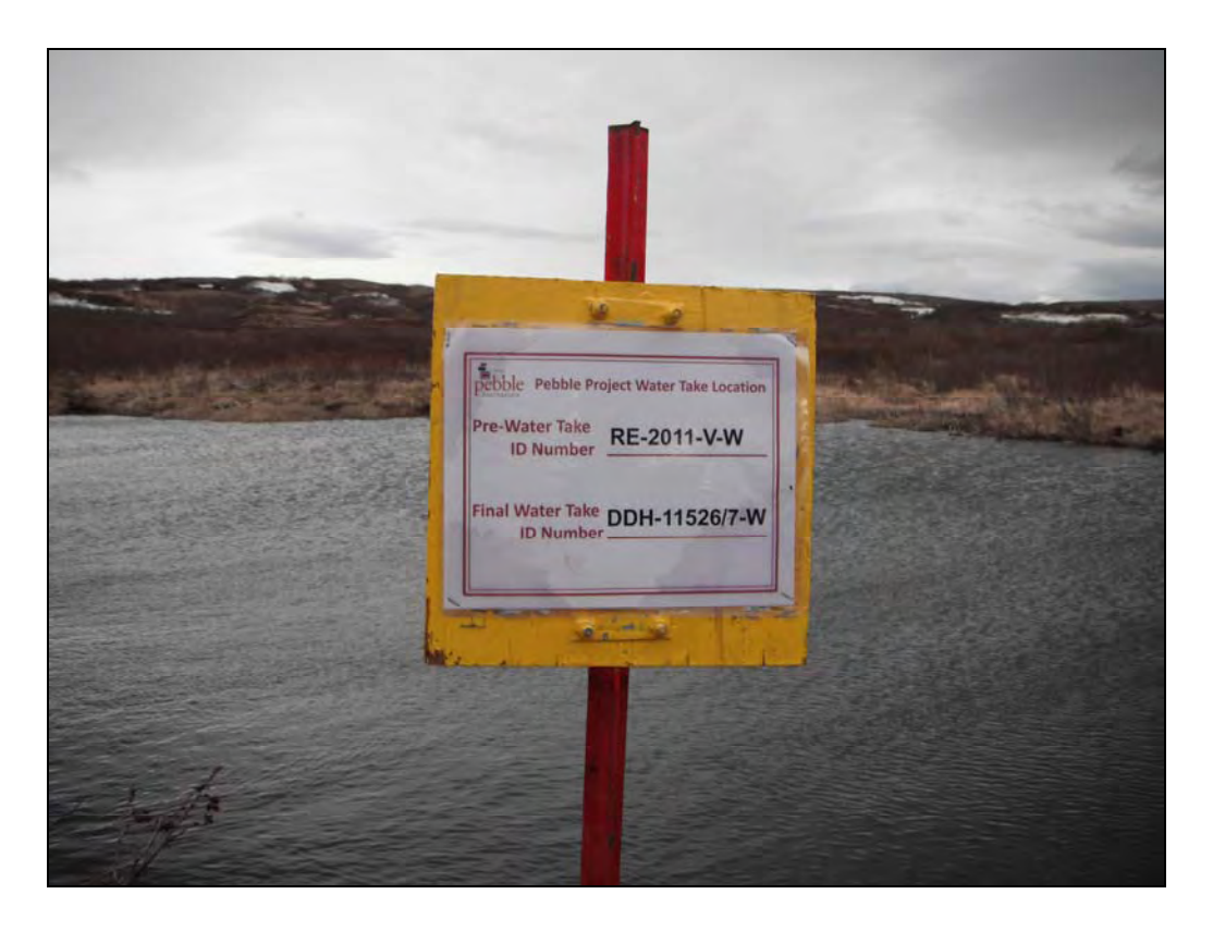
Figure 7. Proper signage designating the water take location with the identification numbers.