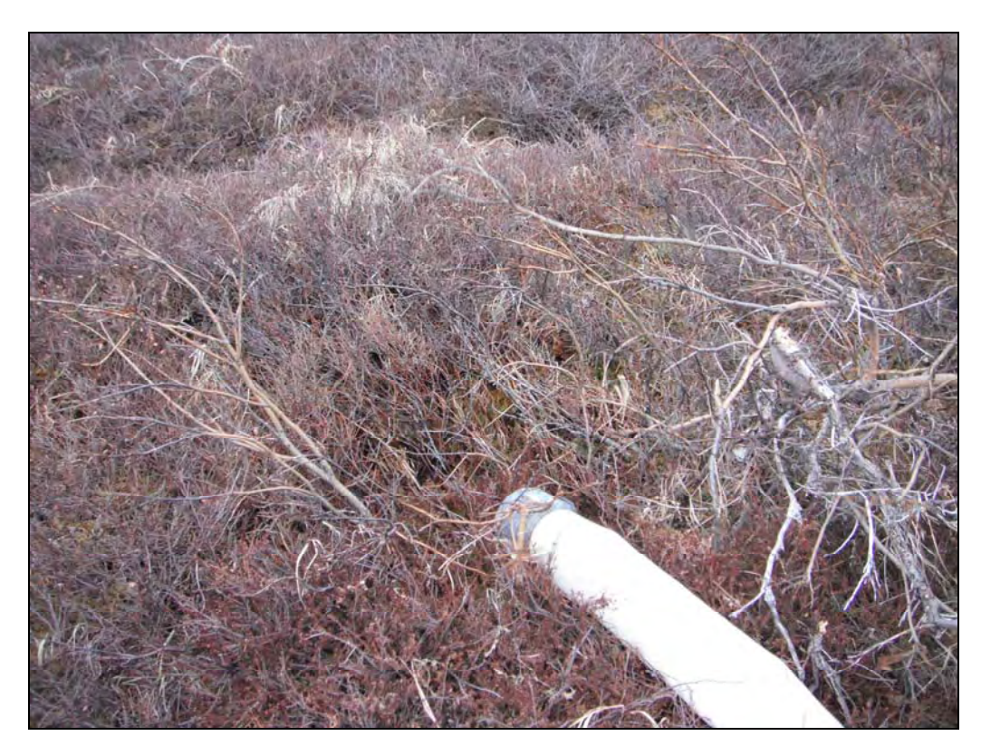
Figure 14. End of sump pit discharge line. Because drilling was shut down, no discharge was occurring during the inspection.