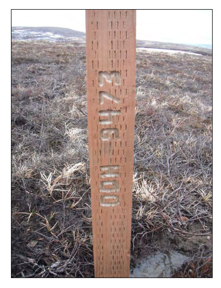
Figure 21. Sign post for reclaimed drill hole 9473.