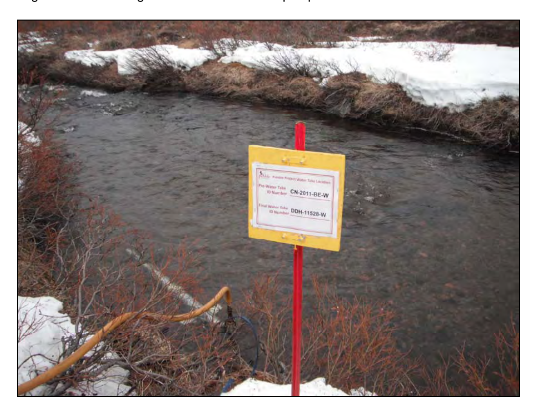
Figure 16. Proper signage designating the water take location with the identification numbers.