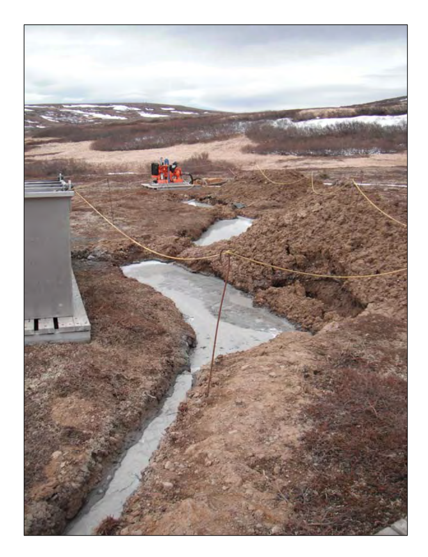
Figure 3. Series of sump pits (left) and stockpiled muck (on right) to be used later in site reclamation.