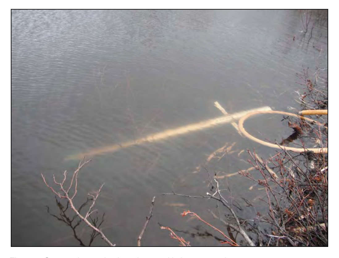
Figure 8. Screened water intake submerged in beaver pond.