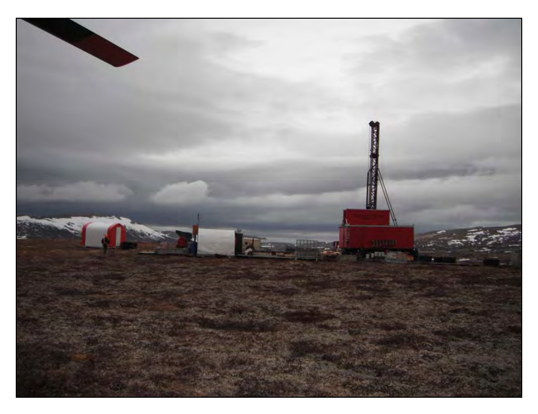
Figure 1. Drill rig # 2 on site of DDH 11526/11527.