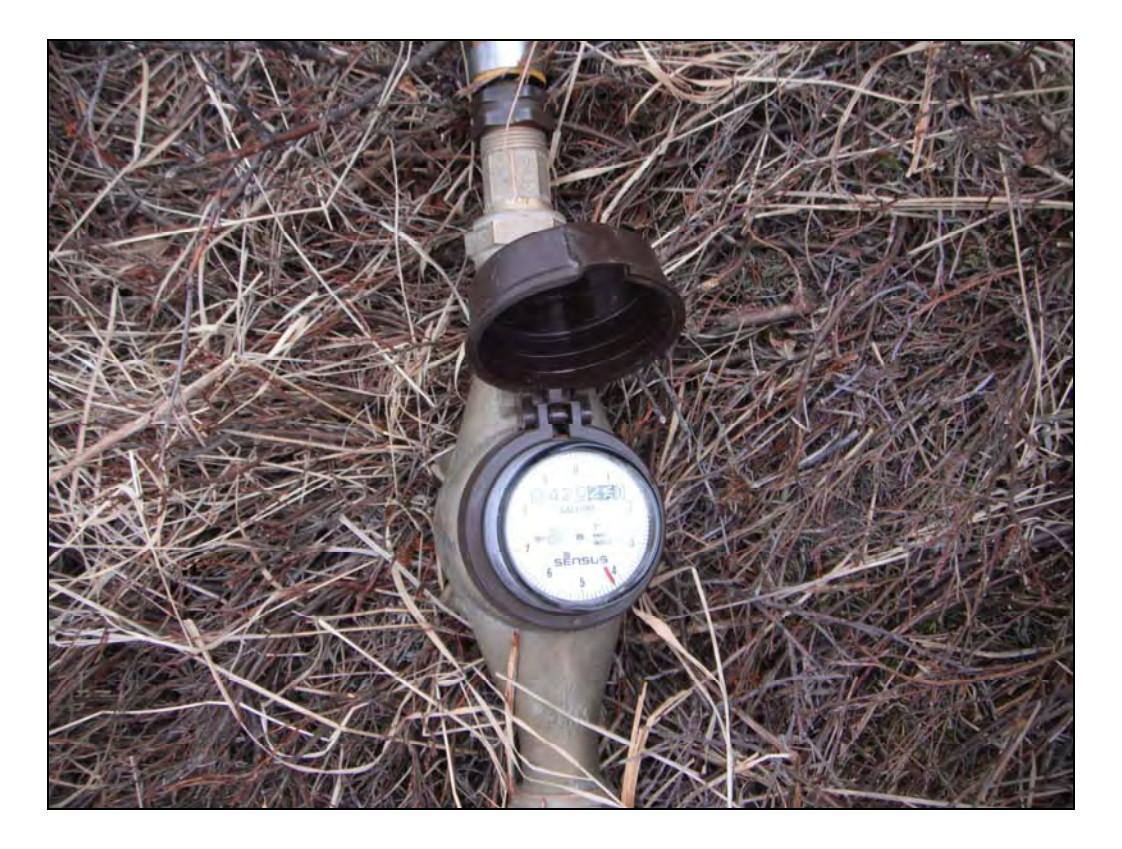
Figure 9. Totalizer connected to water intake line. Field estimate of water withdrawal rate was 23 gpm during the inspection.