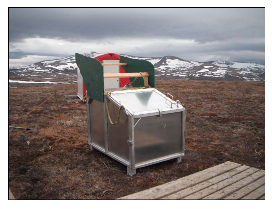
Figure 6. New aluminum dumpsters for trash containment.