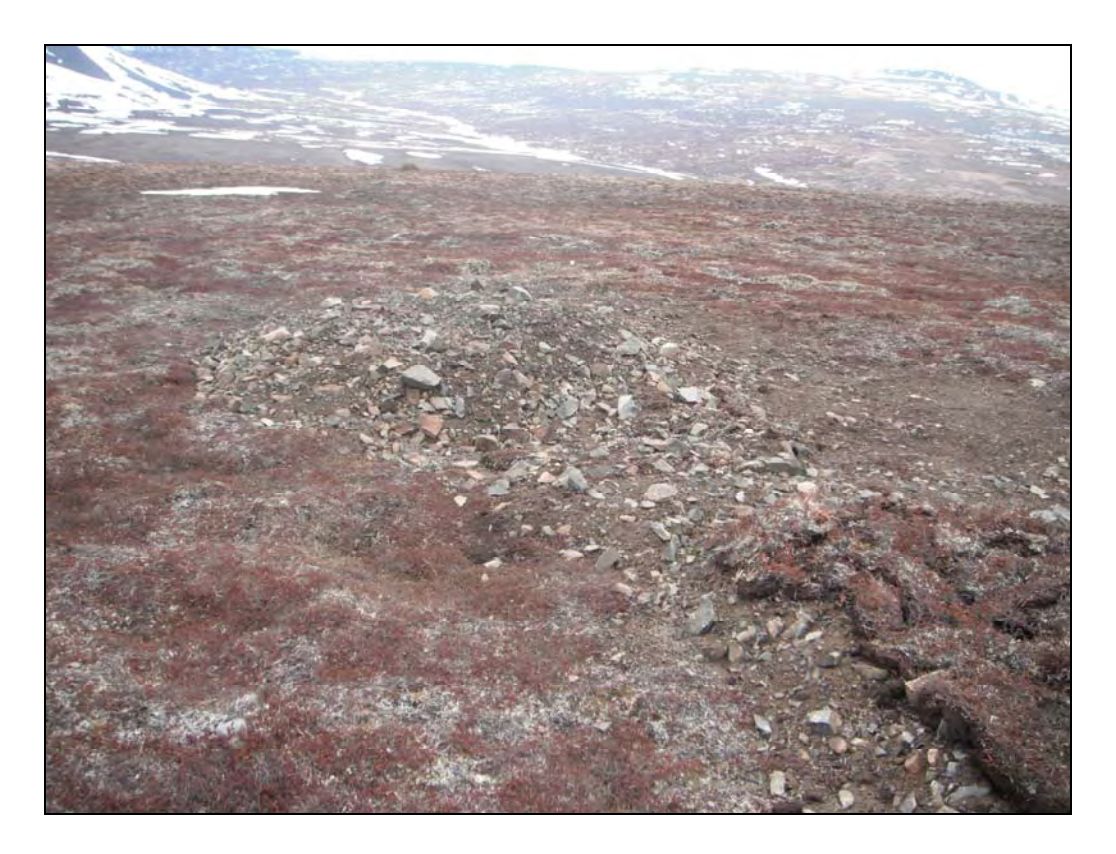
Figure 20. Gravel/rock pile near reclaimed sump pit. This site is 90% complete and the crew will be revisiting this site to smooth out this pile and make more even with existing tundra.