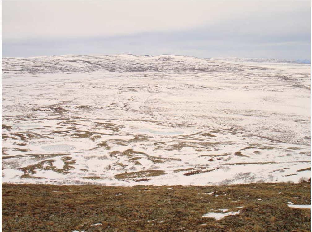
Figure 1. View from Koktuli Ridge looking west over project area.