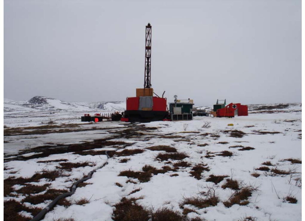
Figure 2. Drill rig with supplies and emergency shelter.