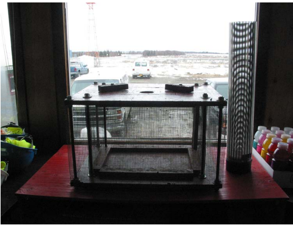
Figure 5. Water withdrawal fish screen box.