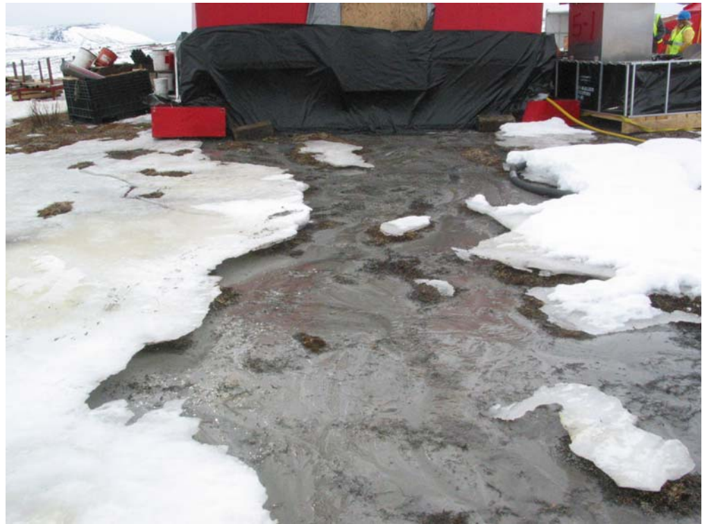
Figure 4. Water and cuttings discharge on uplands.