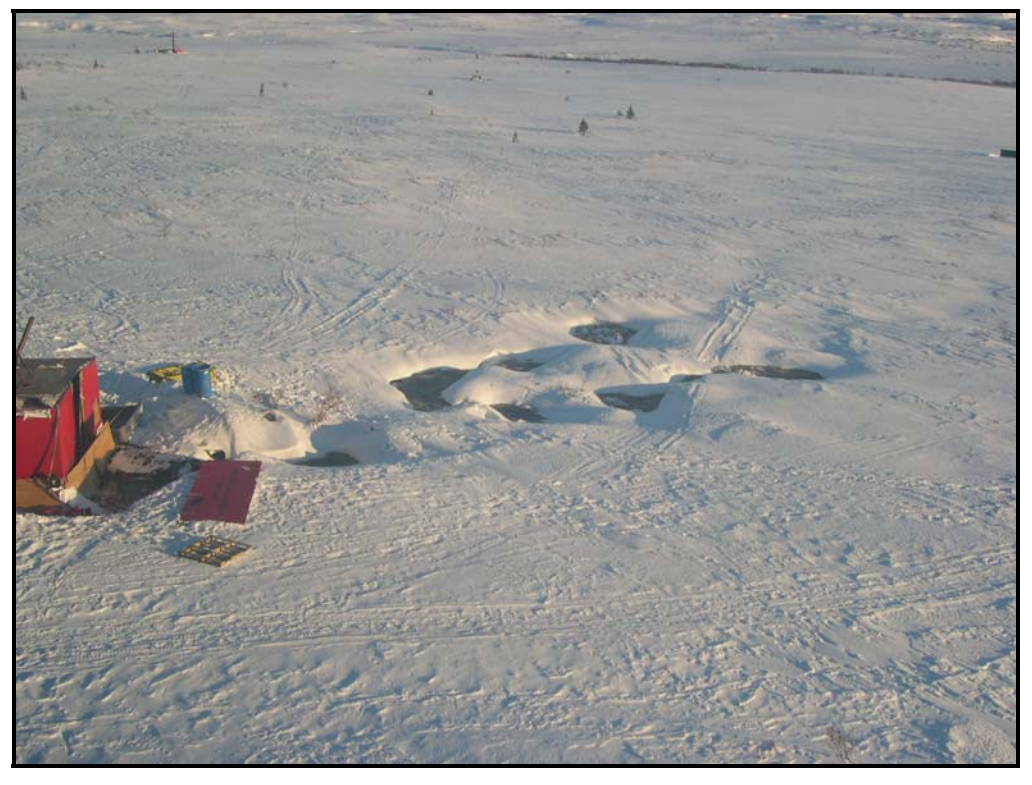
Figure 6. Drill water discharge, drill rig number 3.