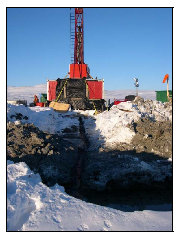
Figure 7. Water recycle sump, drill rig number 5.