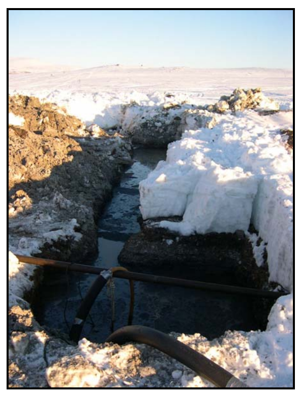
Figure 8. Water recycle sump, drill rig number 5.