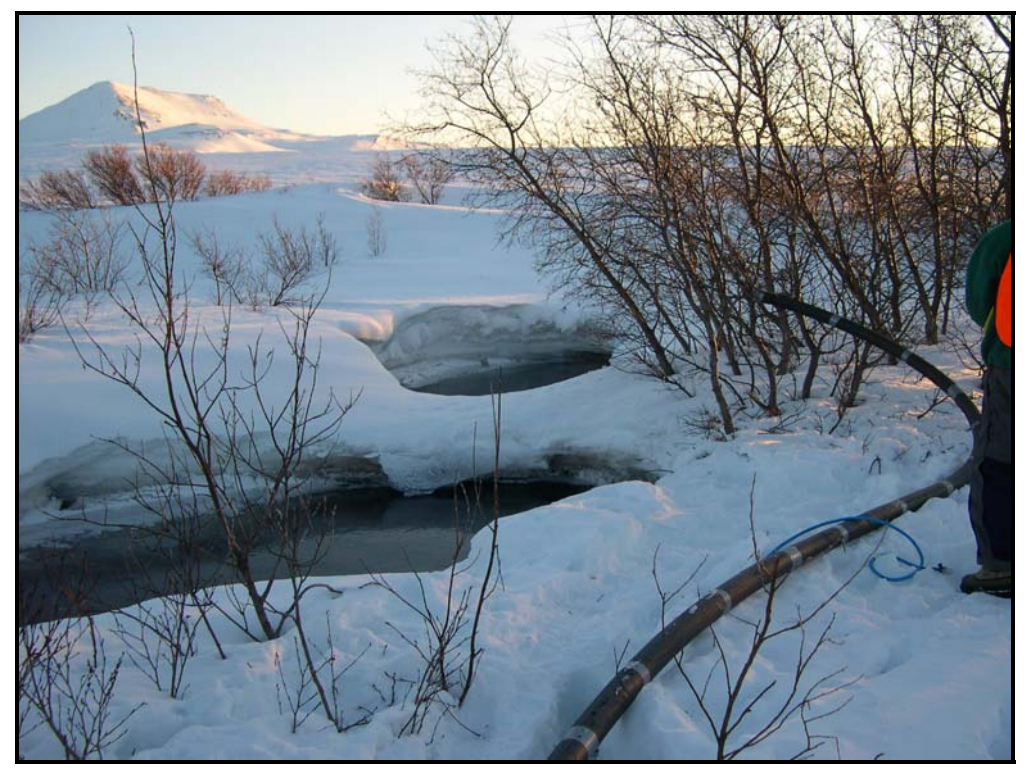
Figure 4. Water withdrawal point, drill rig number 2, Upper Talarik Creek.