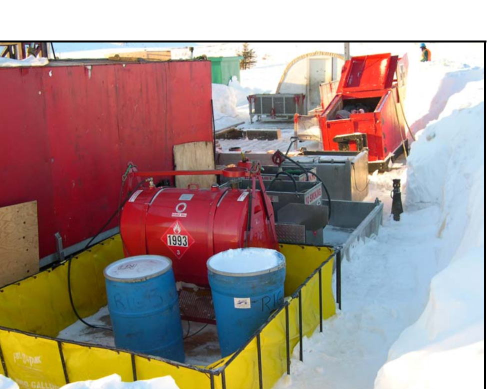
Figure 5. Fuel storage drill rig number 3