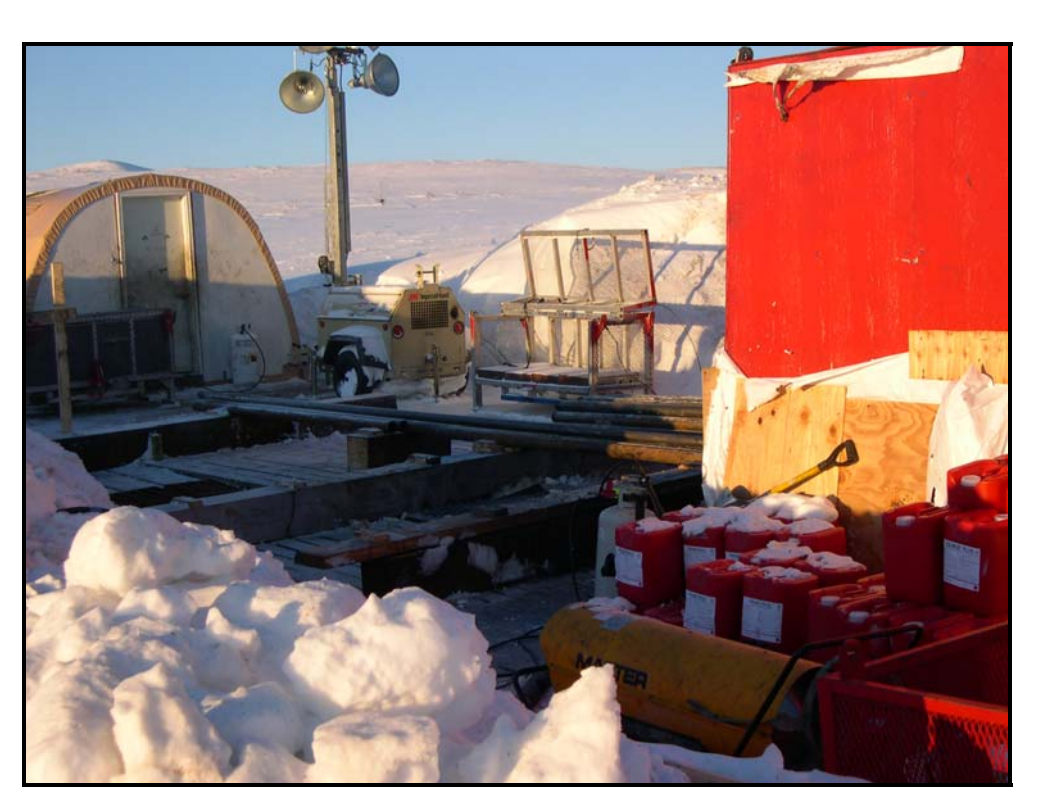
Figure 3. Drill rig number 2.