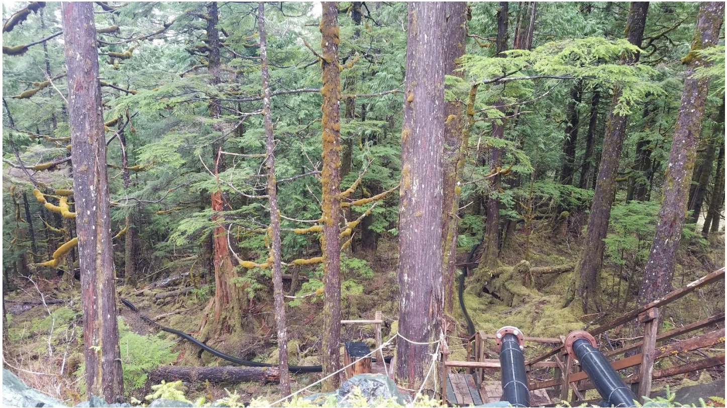
Land Application/Dispersment (LAD) system