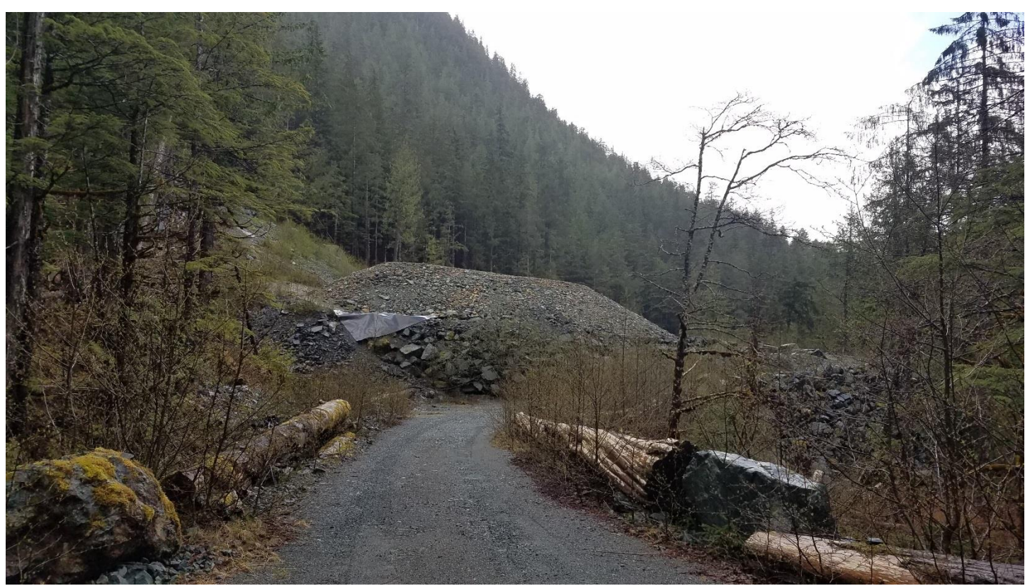
Fully lined PAG rock storage pile