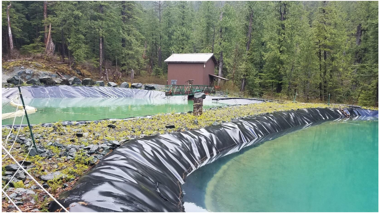
Settling ponds with water treatment facility at back