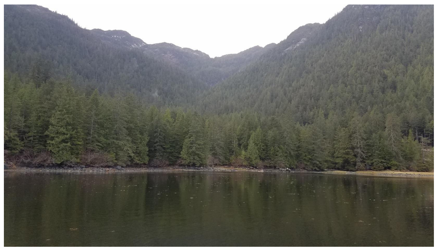
Looking back into the Niblack Anchorage bay

Thanks to Graham for a safe trip to the Niblack exploration project.