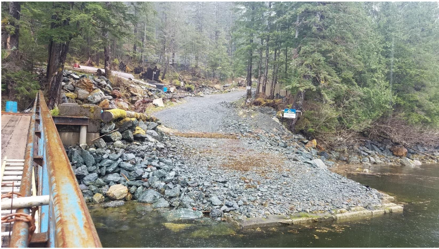
Road from dock/camp facility up to other areas of the exploration project