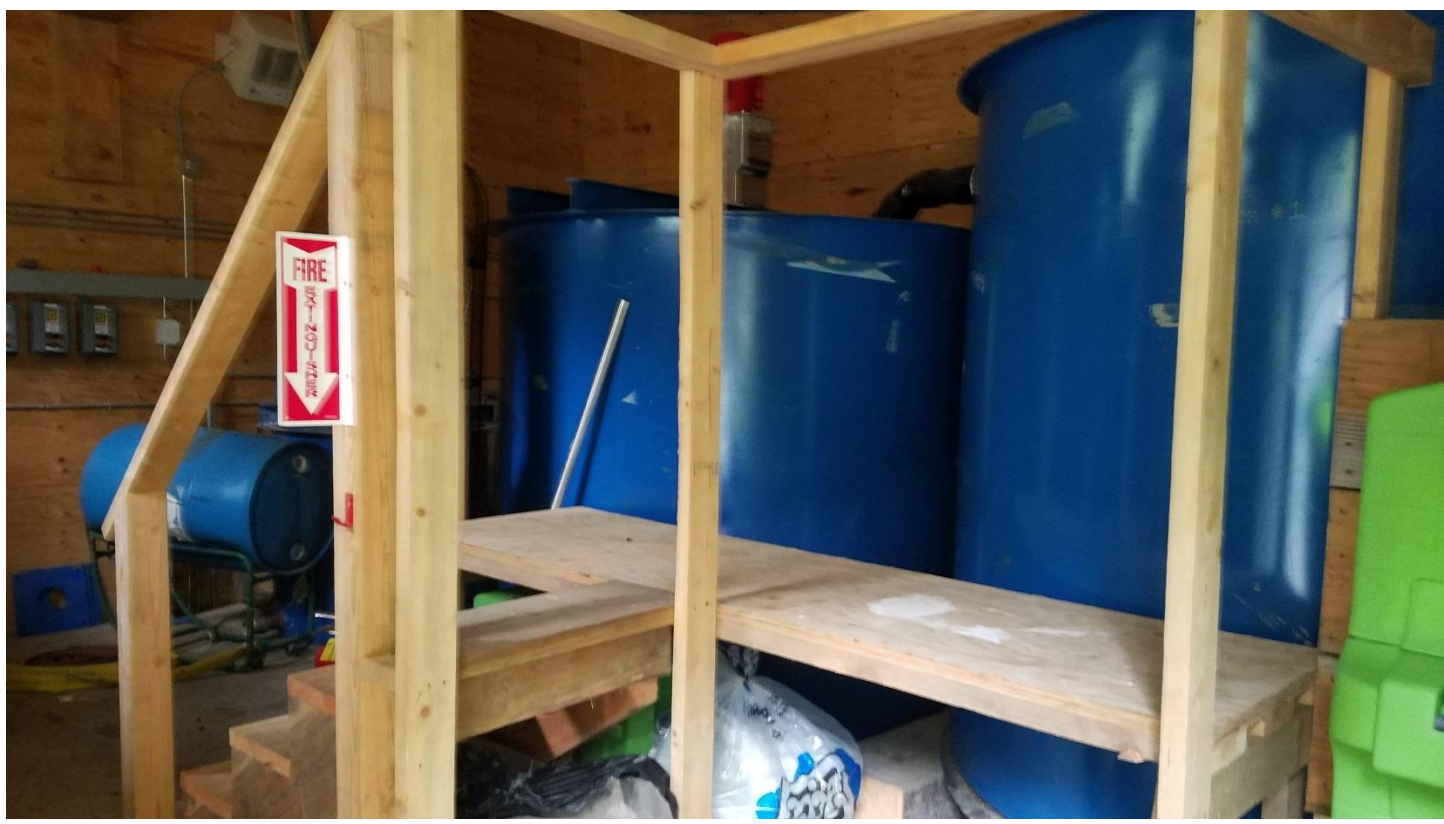
Inside water treatment facility