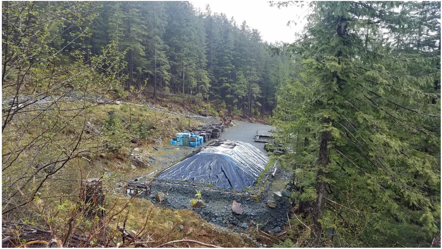
Fully lined and covered low-grade PAG ore pile