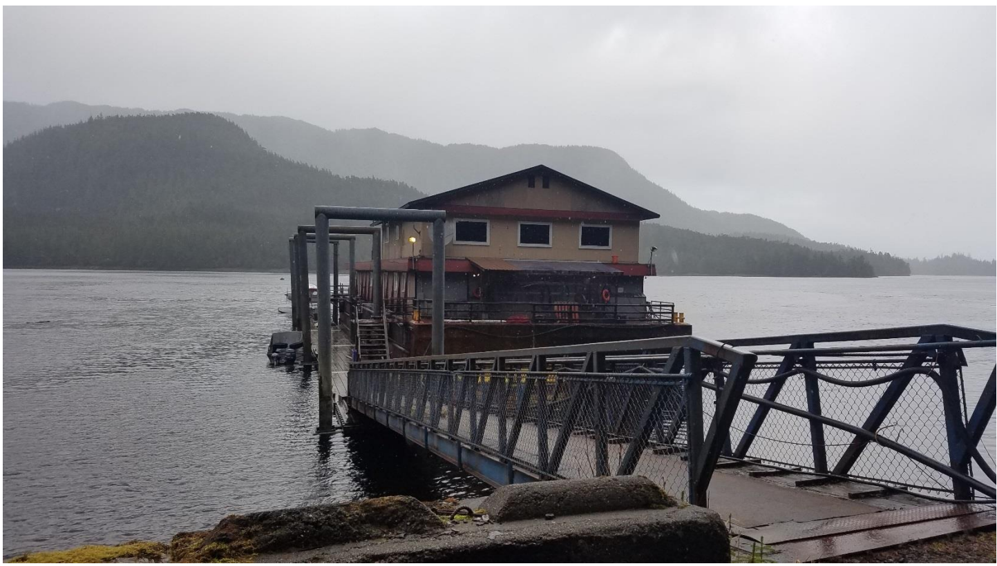
Dock/floating camp facility from road