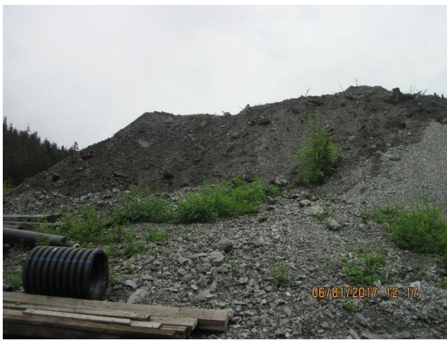
Photo 14. 8,000 cubic yards of topsoil was stockpiled at the Mud Dump.