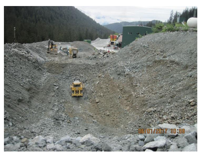
Photo 11. 30,000 cubic yards of waste rock was removed from the Kensington Development Pile.