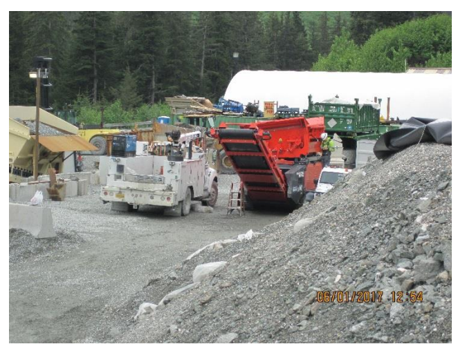
Photo 13. A rock shaker (red machine) will be used to separate large rocks from smaller rocks.