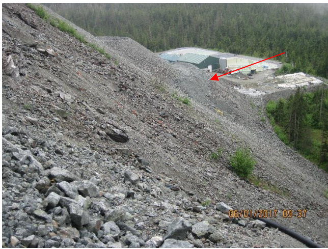
Photo 2. Waste rock from the Raven drift is being deposited at Southwest section of the Comet Development Pile.