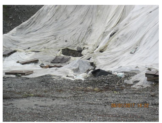
Photo 20. Sections of liner have pulled apart and need to be fixed.