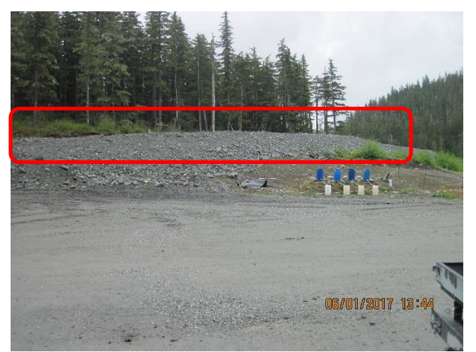
Photo 19. Highlighted area shows the location for the new access road at the northern TTF.