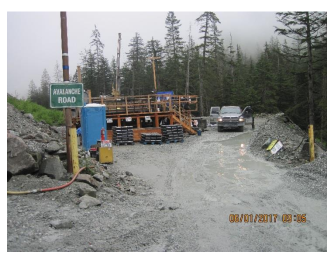
Photo 1. Surface exploration drill located on the Kensington side of the mine site.

PHOTOS (Additional photos available upon request).