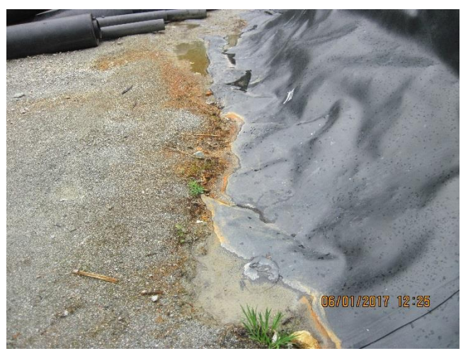
Photo 15. Along the edge of the GP liner at the Mud Dump, reddish color water observed.