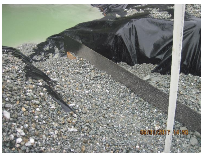
Photo 24. A new water bar was installed near the port facilities (Image 1 of 2).