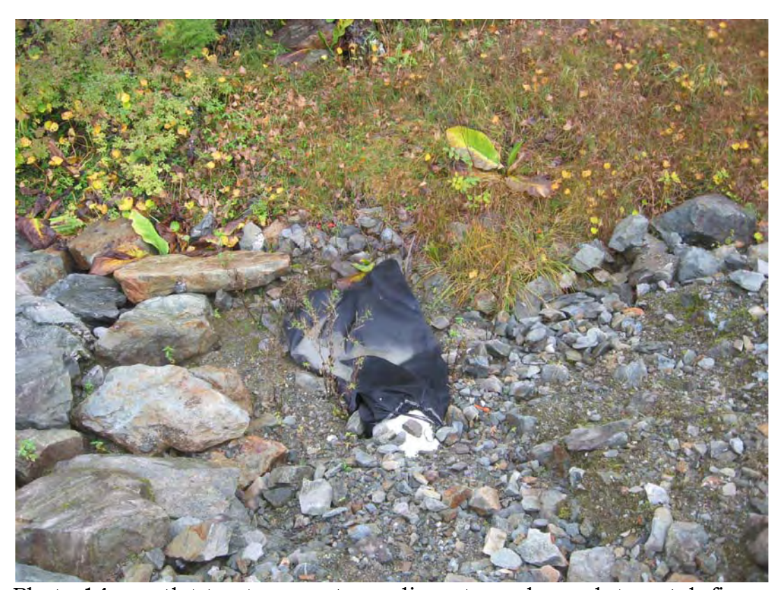
Photo 14 – outlet to storm water sediment pond – sock to catch fines