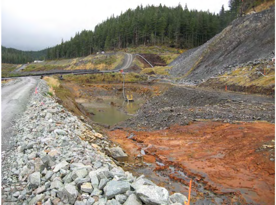
Photo 6 – dewatered "Big Hole" and graphitic phyllite (near - red/gray)