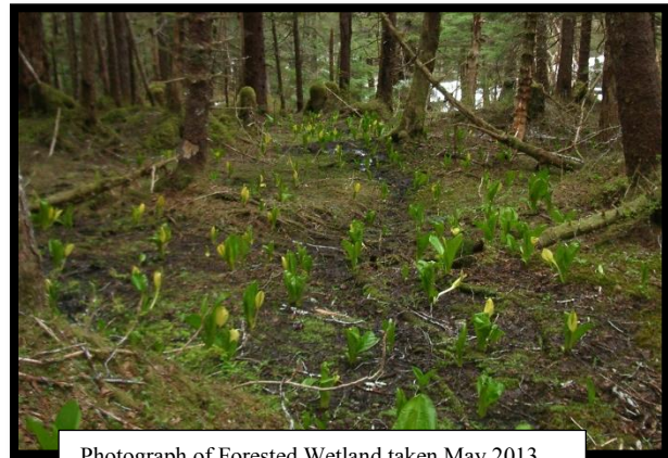
Photograph of Forested Wetland taken May 2013.

The Forested Wetlands are comprised of slope and toe-slope fen wetlands. National Wetlands Inventory (NWI) mapping generally captures the occurrence of the toe-slope fen wetlands. However, the NWI does not capture the forested slope wetlands that occur on the slopes above the wide glaciomarine terrace perched above Gastineau Channel (Sheet 13; Appendix C).