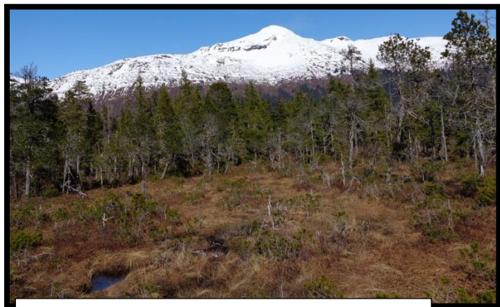
Photograph of Bog fringed by Bog Woodland taken May 2013.

National Wetlands Inventory (NWI) mapping generally captures the full extent of the Bog/Bog Woodland comprised of bogs with emergent and scrub-shrub Cowardin vegetation classes. However, the areas mapped by the NWI as PFO4B coincide with a