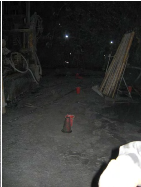
4" diameter holes in the ore body/stope filled with explosive.