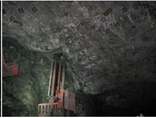
Rock bolting safety mesh.