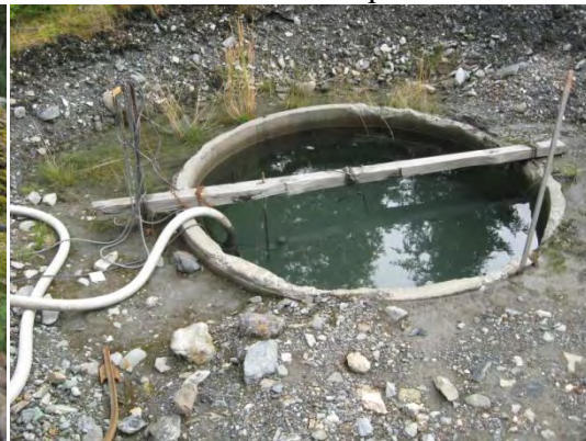
Sump at Site E