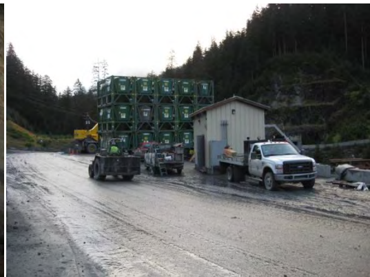
Mine drainage tank and drainage/sediment pump; surface degritting chamber.