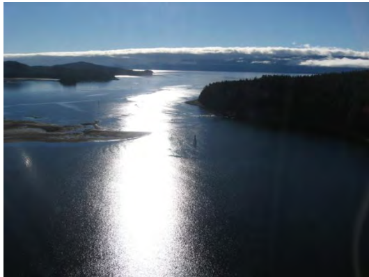
Location of outfall diffuser (in narrow channel).