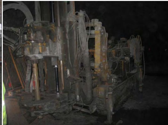
Drill and drill rig for 4" diameter downholes in the stope.