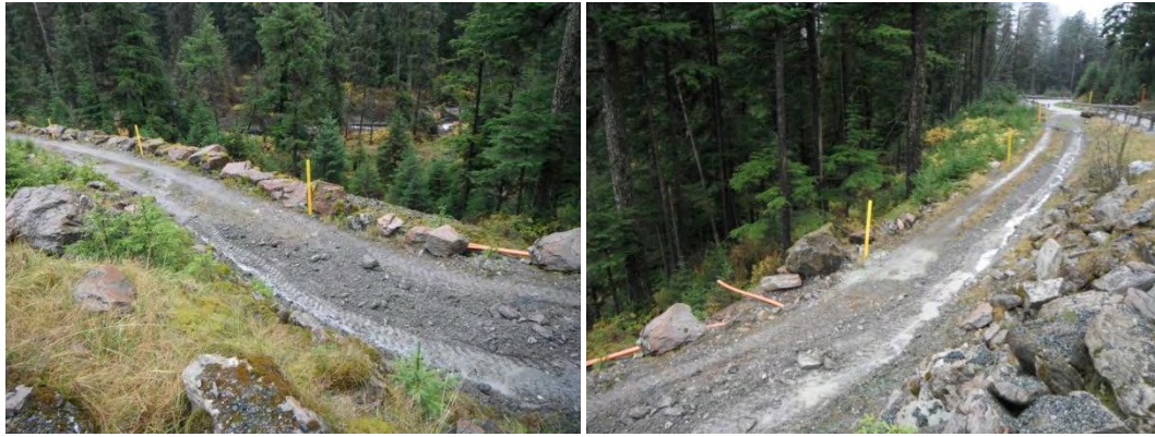
Ditch work along the inside of the auxiliary access road on to the D Pile. This work was done on the 15 October 2012.