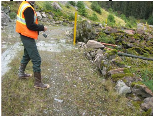
Road drainage adjacent to Site D