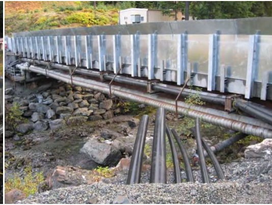
High splash walls on the bridge over Greens Creek outside the 920 portal.