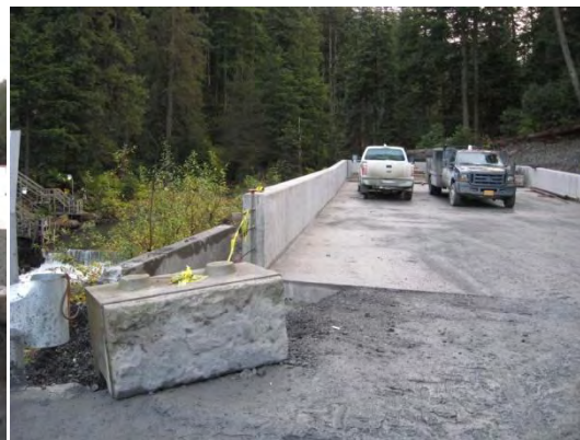
Concrete pads and walls to each side of the 920 mine entrance.