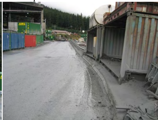
Road / containment for thickener tank spill