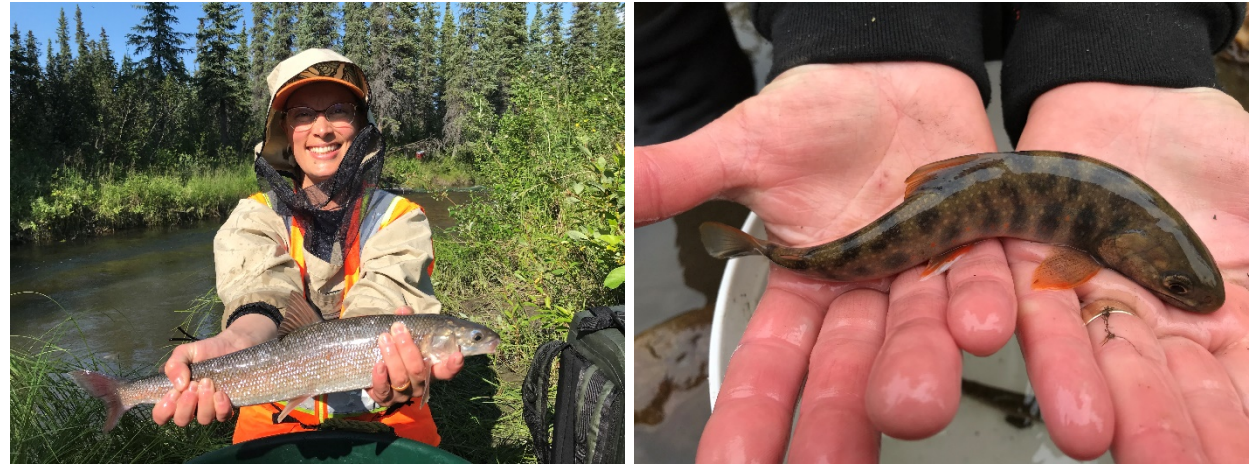
Figure 3. Adult round whitefish (left) captured in the Ruby Creek fyke nets, and an adult dwarf Dolly Varden (right) captured in a minnow trap on Jay Creek, 2021.