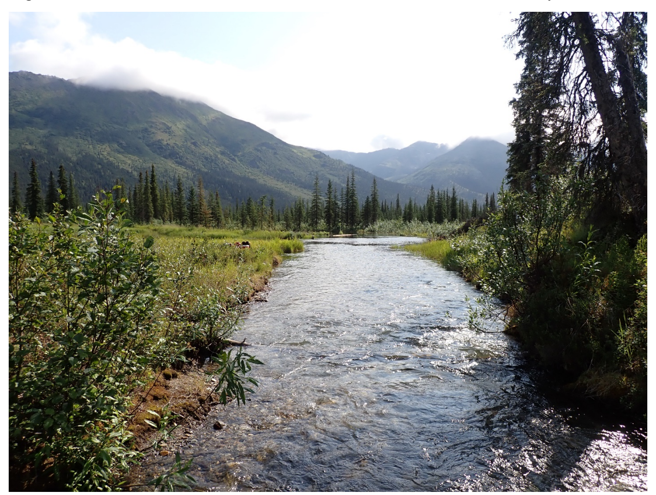
Figure 2. Sunshine Creek sample site, new to 2021.

In general, at each site sampled with minnow traps, 10 traps were fished overnight and checked approximately 24 hours later.