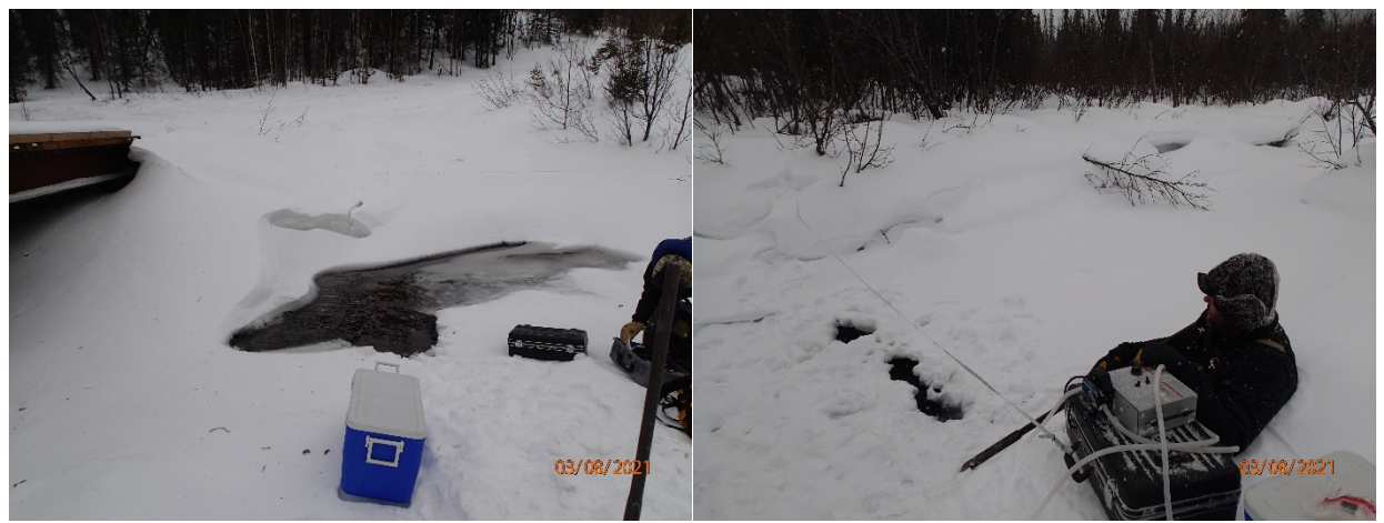
Figure 1. Wesley Creek (left) and Ruby Creek just upstream of the bridge (right)

We snowmachined to two road accessible sites, Wesley Creek and Ruby Creek (road crossing), and two off-road sites, Shungnak River at the mouth of Ruby Creek and Ruby Creek just upstream of the mouth. We collected water samples for laboratory analysis and measured flow rates. Wesley Creek had open water and Ruby Creek had about 3 inches of ice with flowing water below (Figure 1).