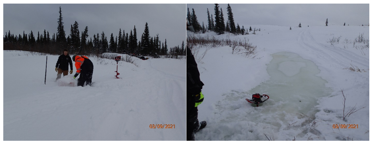
Figure 2. Sampling sites on the Shungnak River at the mouth of Ruby Creek (left) and on Ruby Creek just upstream of the mouth (right).

Shungnak River, but were unable to collect data on Ruby Creek since there was not sufficient flow under the ice.