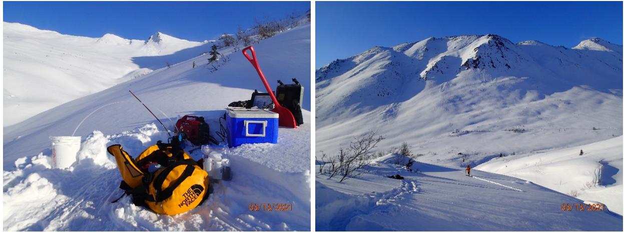
Figure 7. Pumping water from a groundwater well (left) and conducting a snow survey (right) below the Arctic deposit.