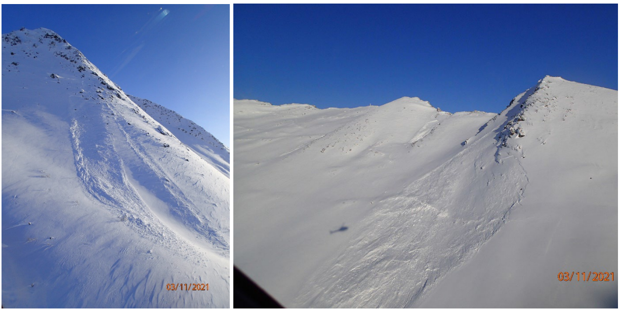
Figure 8. Avalanches through the Subarctic valley.