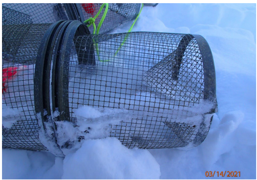
Figure 5. Ice that formed on a minnow trap at mid Subarctic during an overnight set.

Minnow trapping conditions were challenging at upper and mid Subarctic Creek. Although the water was open and flowing, it was between 6 and 8 inches deep, making it difficult to submerge the throats of the minnow traps. It was -20°F during the day and below -30°F at night, so many of the entrances to the minnow traps froze up overnight, preventing fish from entering (Figure 5). Despite these difficulties, one Dolly Varden was captured in the most upstream minnow trap at upper Subarctic Creek (Figure 6). Since the air temperature was -20°F the fish was not removed from the water, but was estimated to be about 4 inches fork length.