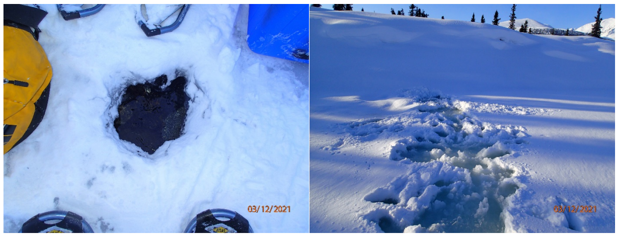
Figure 3. Flowing water under ~4 inches of ice at the gaging station on Subarctic Creek (left) and overflow on the Shungnak River at the gaging station downstream of the mouth of Subarctic Creek.

All other sample sites were accessed using an A-star helicopter. Surface water sampling was conducted at upper Subarctic Creek, mid Subarctic Creek, Subarctic Creek at the gaging station, and on the Shungnak River at the gaging station downstream of the mouth of Subarctic Creek (Figures 3 and 4). There was open water at upper and mid Subarctic, and the ice was approximately 4 inches thick with flowing water underneath at the gaging station on Subarctic Creek. There was a mix of frozen and slushy overflow at the Shungnak River downstream of the mouth of Subarctic Creek that bound up the ice auger and prevented us from obtaining water samples. Minnow traps were set in open water at upper Subarctic Creek and mid Subarctic Creek and allowed to soak overnight (Figure 4 and Table 1).