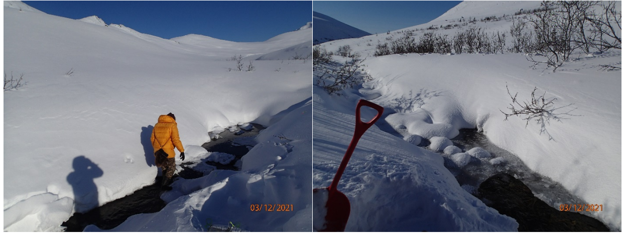
Figure 4. Checking minnow traps at upper Subarctic Creek (left) and open water at mid Subarctic Creek (right).