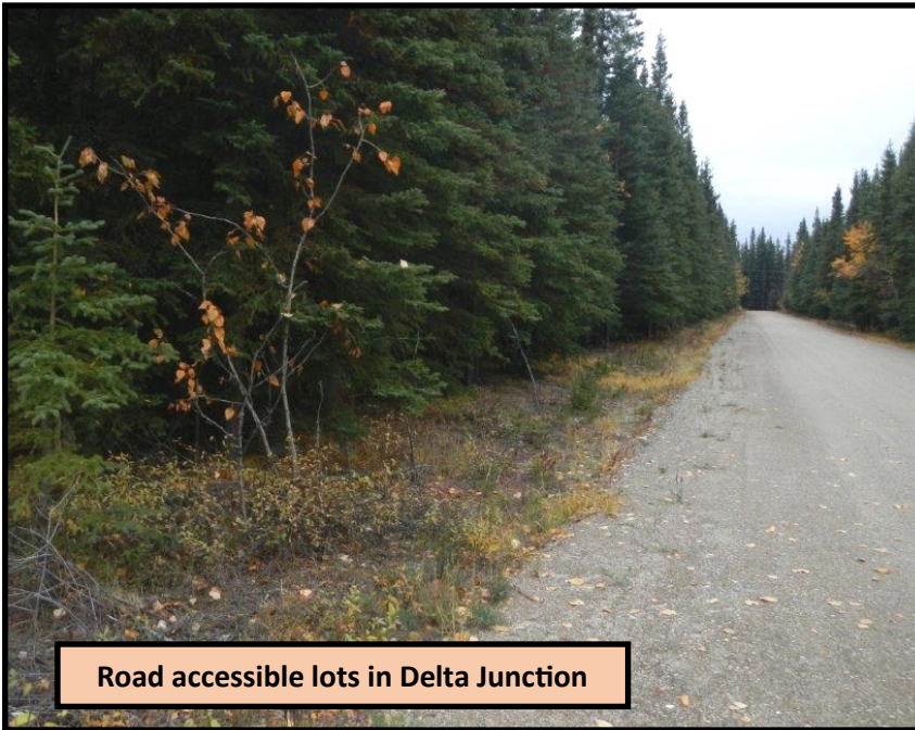
Road accessible lots in Delta Junction