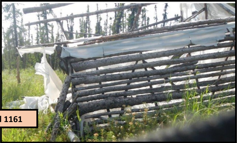
Debris on Parcel 1161