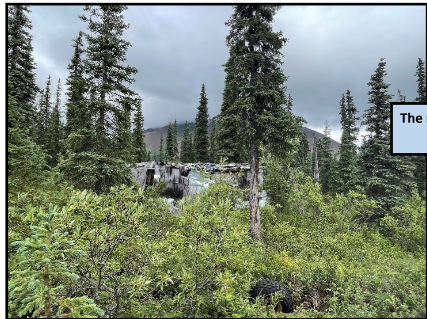
The remaining structure is dilapidated and uninhabitable.