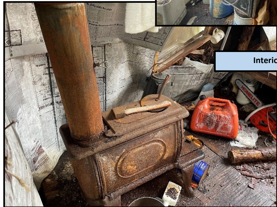
Interior of the structure