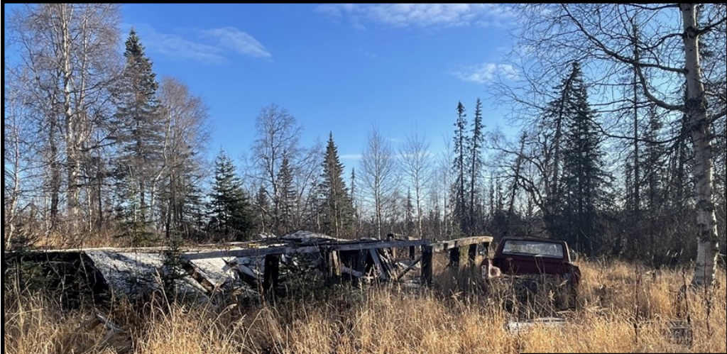
Remnants of an old cabin foundation

This property is being sold As-Is with an old cabin foundation, two vehicles, and a generator on the property.