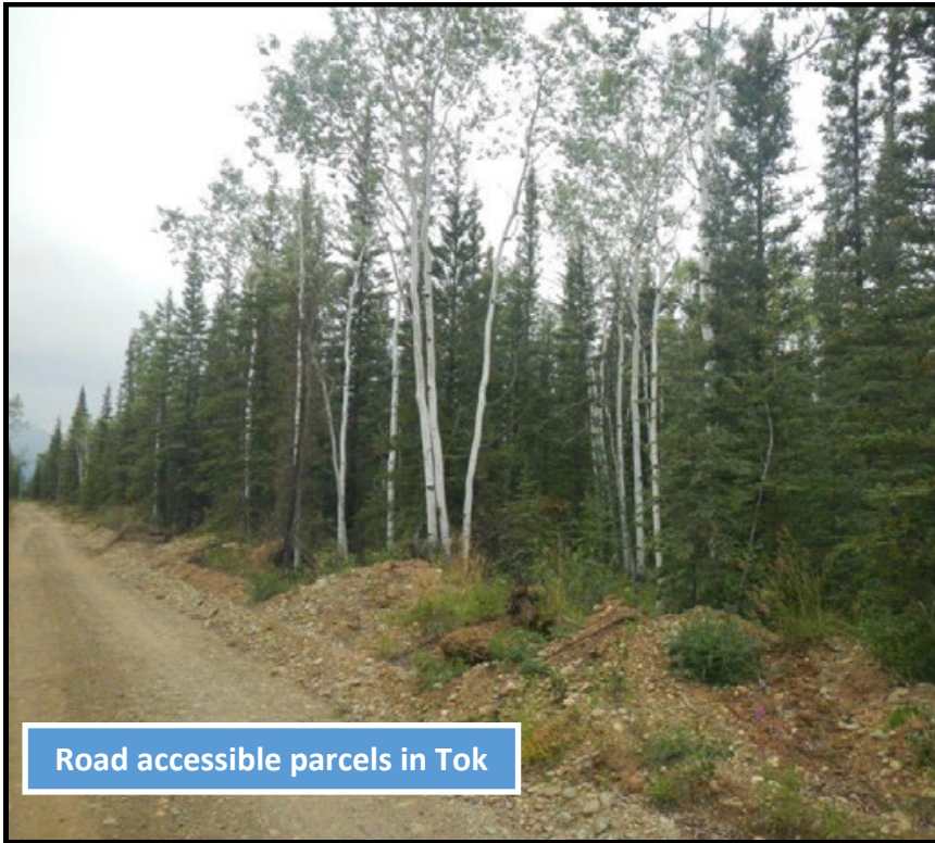
Road accessible parcels in Tok