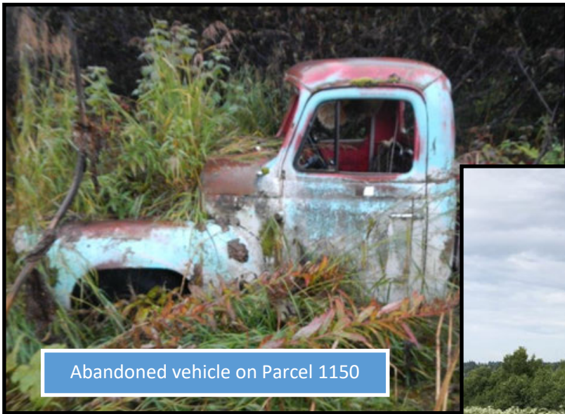
Abandoned vehicle on Parcel 1150