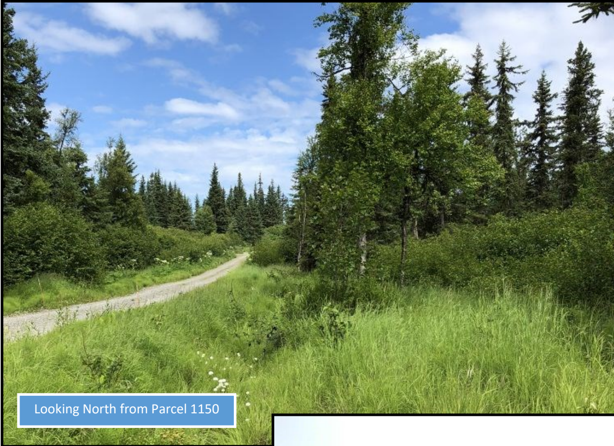
Looking North from Parcel 1150