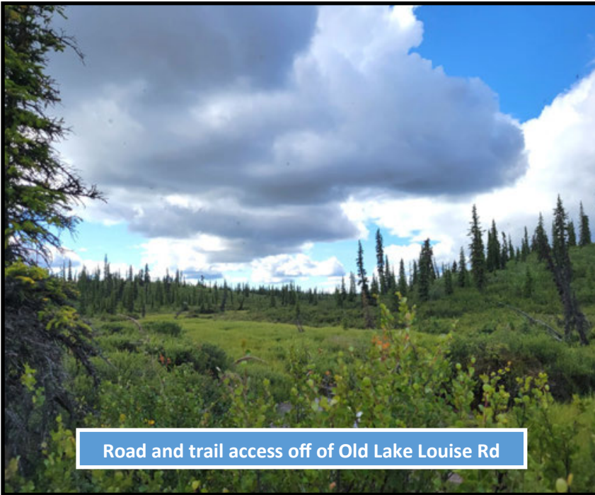
Road and trail access off of Old Lake Louise Rd