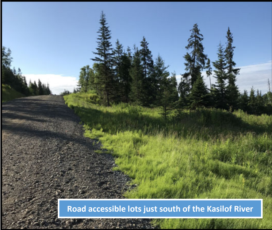
Road accessible lots just south of the Kasilof River