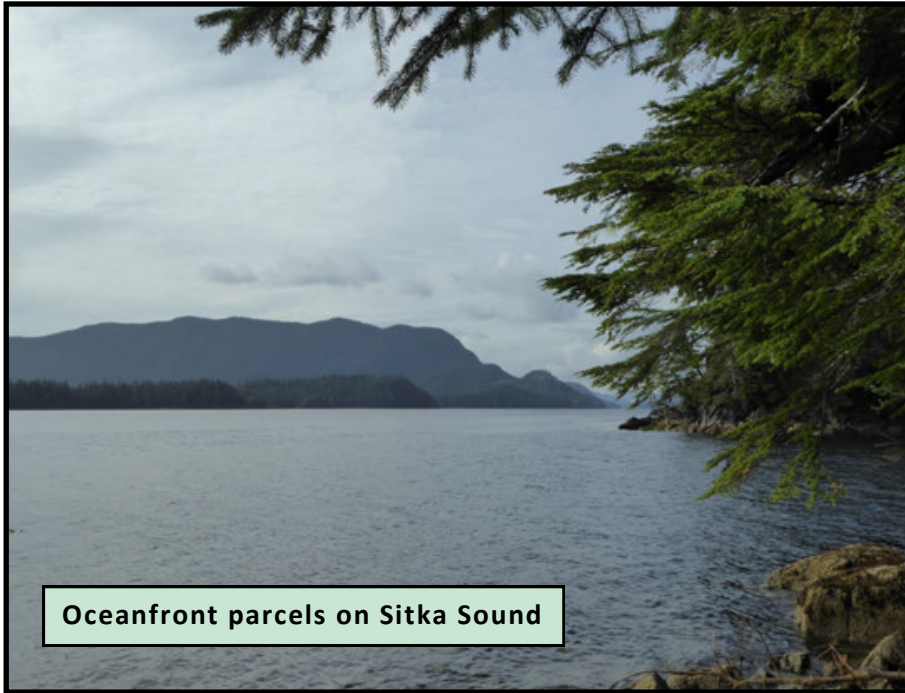
Oceanfront parcels on Sitka Sound