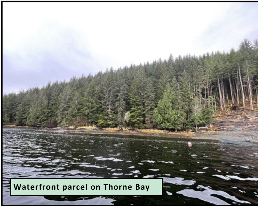
Waterfront parcel on Thorne Bay