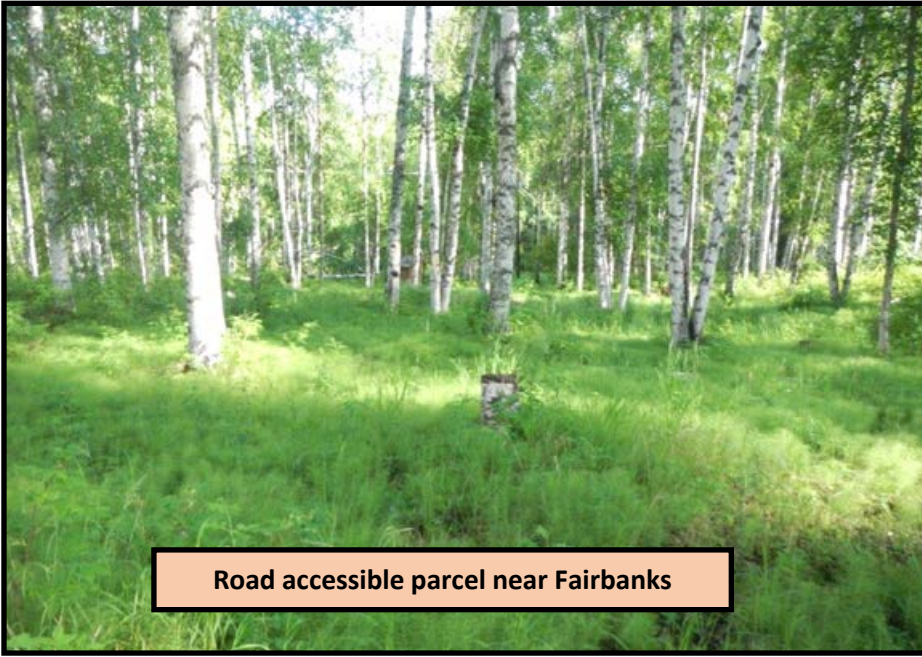
Road accessible parcel near Fairbanks