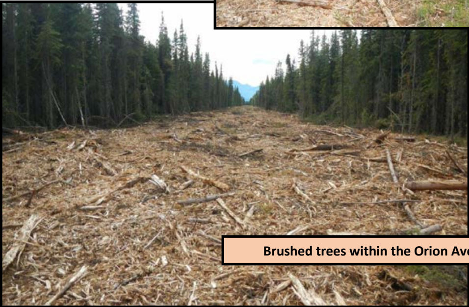
Brushed trees within the Orion Ave right-of-way.

Note: Maps and photos included in this brochure are for graphic and visual representations only and are intended to be used as a guide. Please see Land Records, Photos, Plats, and Maps for details.