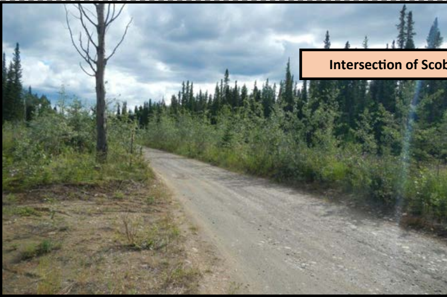
Intersection of Scoby Way and Orion Ave