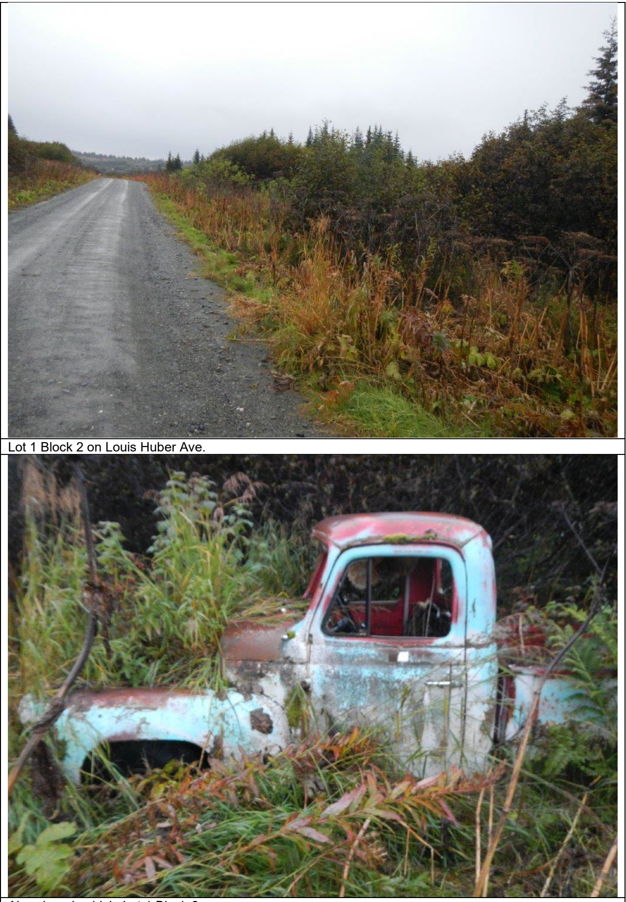
Abandoned vehicle Lot 1 Block 2.