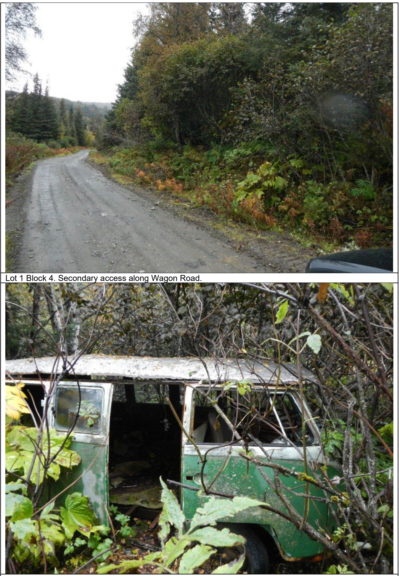
Abandoned vehicle on Lot 1 Block 4.