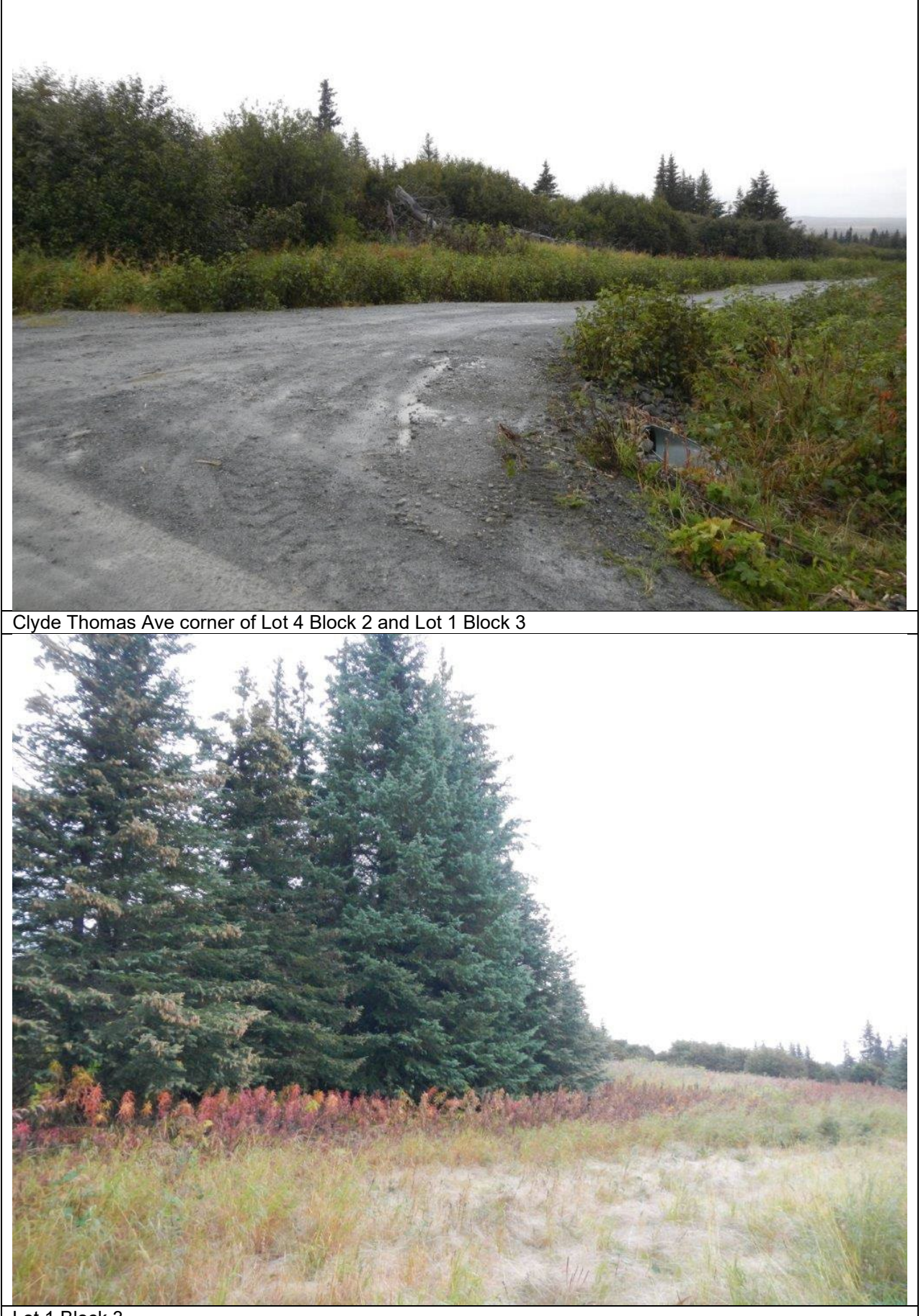
Lot 1 Block 3.