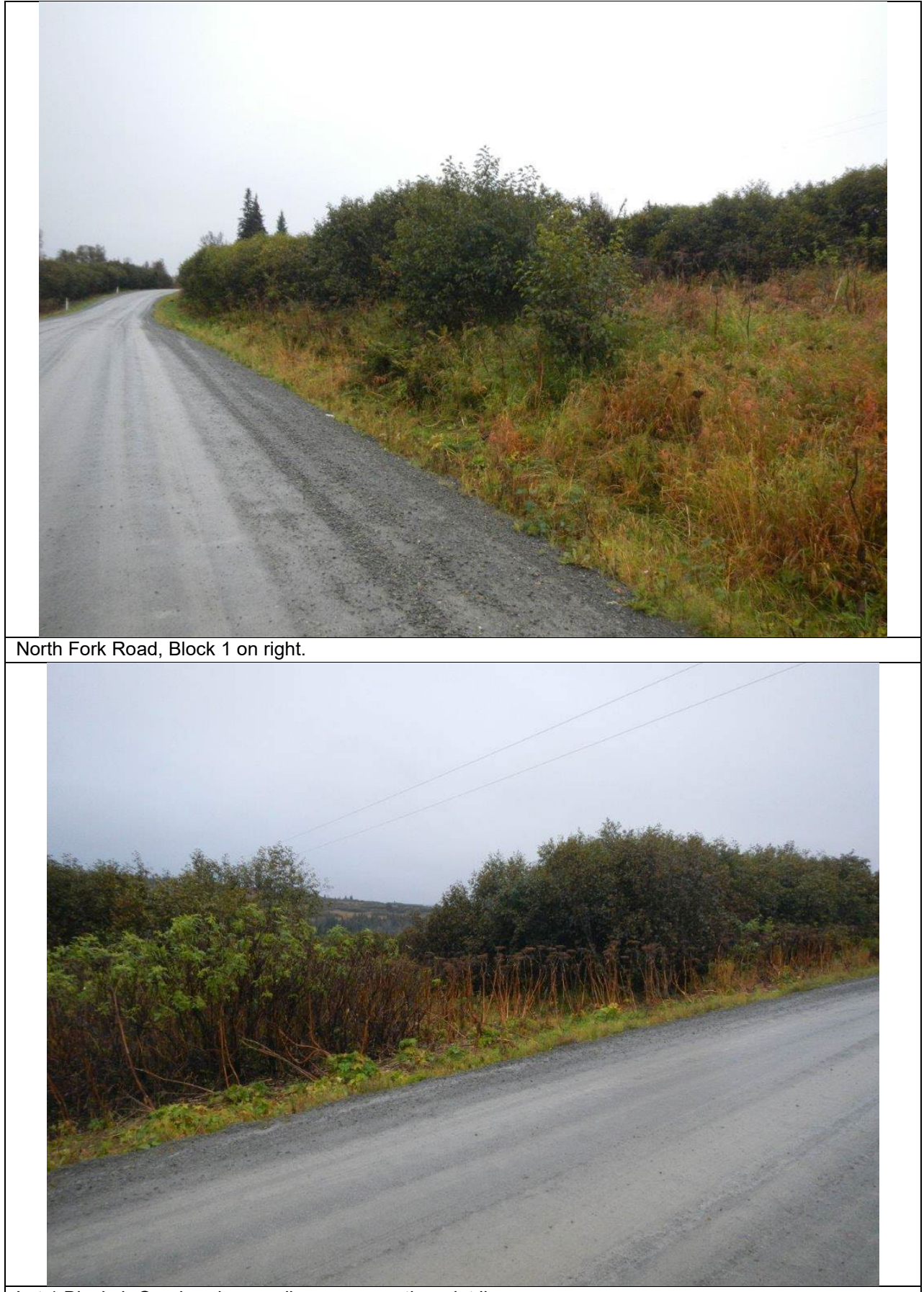
Lot 1 Block 4. Overhead power lines near southern lot line.