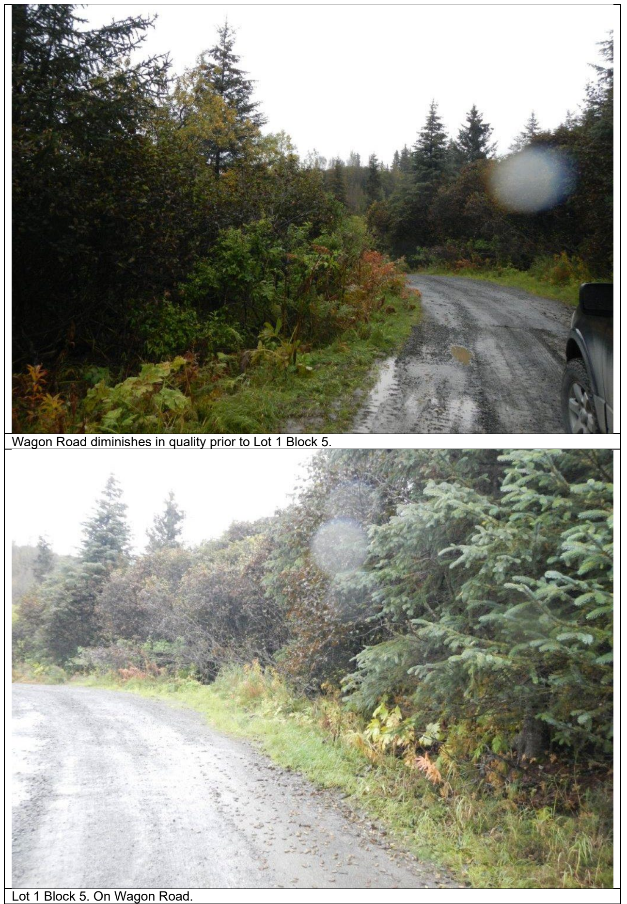
Let T Dieck 5. Off Wagon Rea