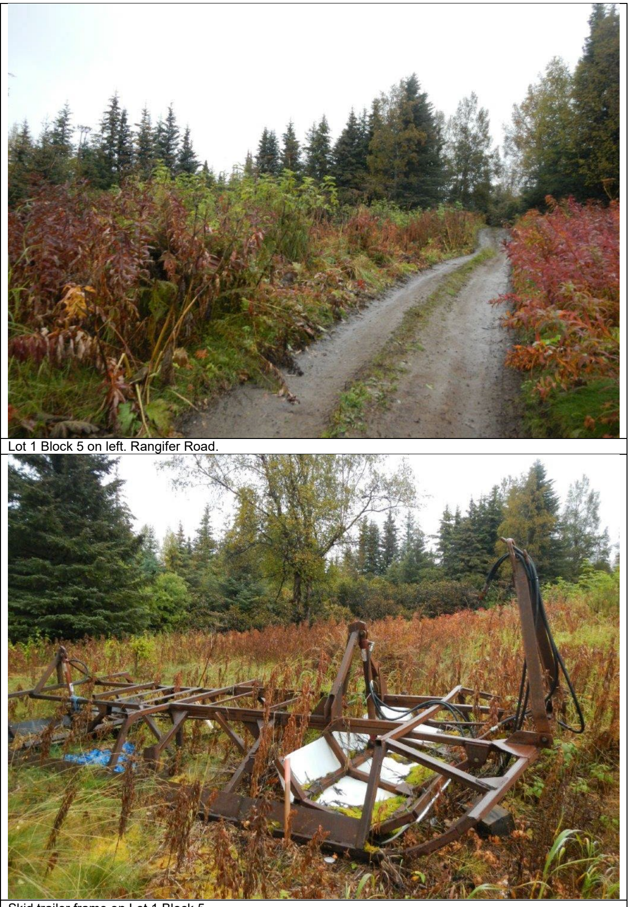
Skid trailer frame on Lot 1 Block 5.