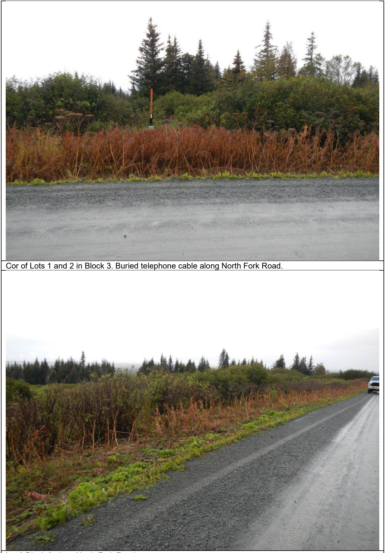
Lot 3 Block 3 along North Fork Road.