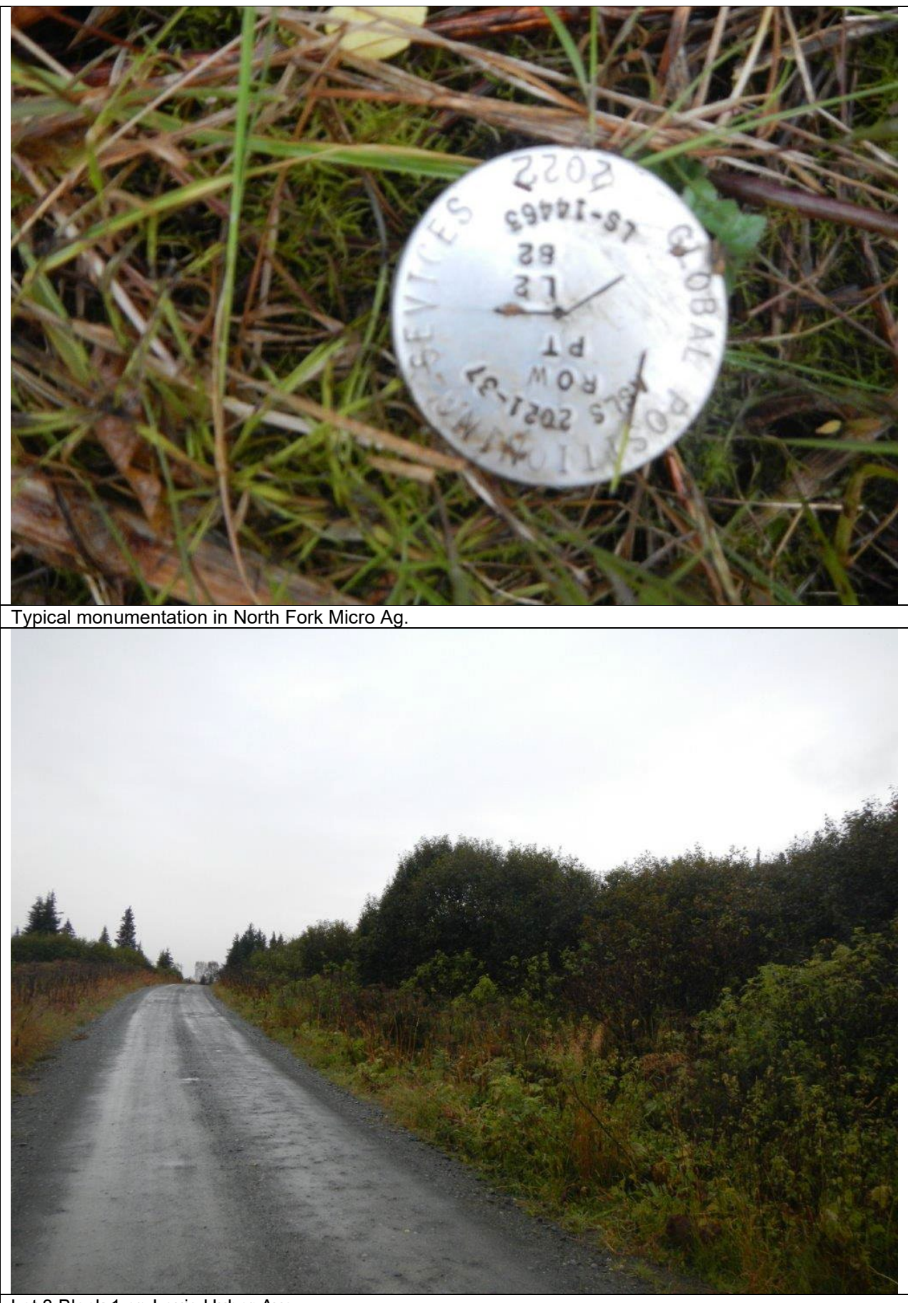
Lot 3 Block 1 on Louis Huber Ave.