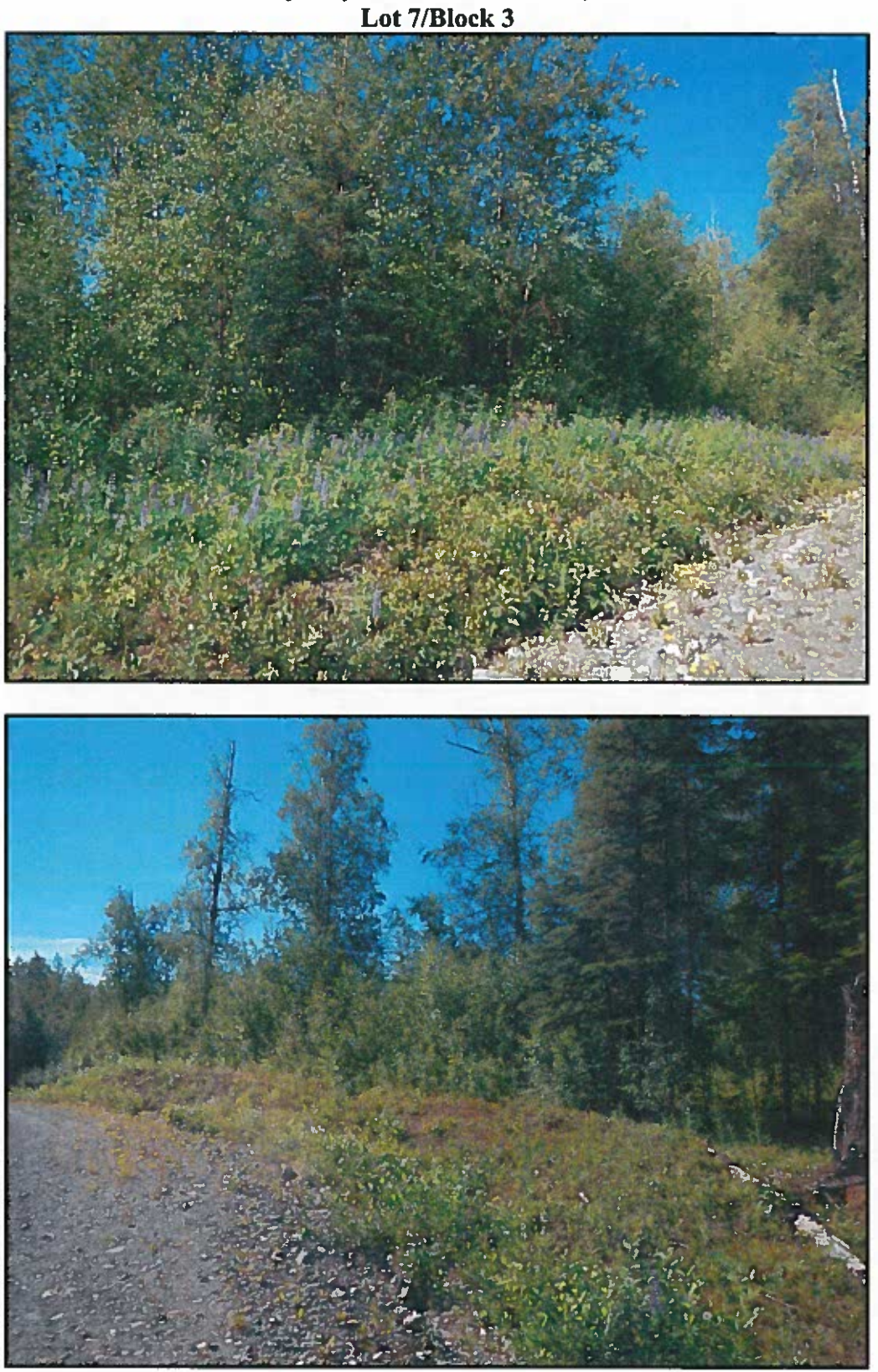
Mystery Alaska Subdivision, Phase I Lot 7/Block 3