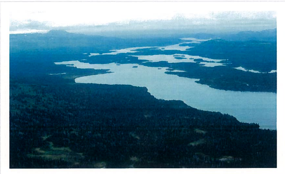
Kakhonak Lake (looking south at Kakhonak Lake)

Photograph provided by DNR staff, date unknown