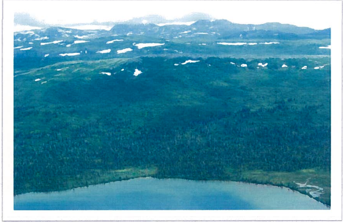
Kakhonak Lake (looking east, at east shoreline of lake in section 5)

Photograph provided by DNR staff, date unknown