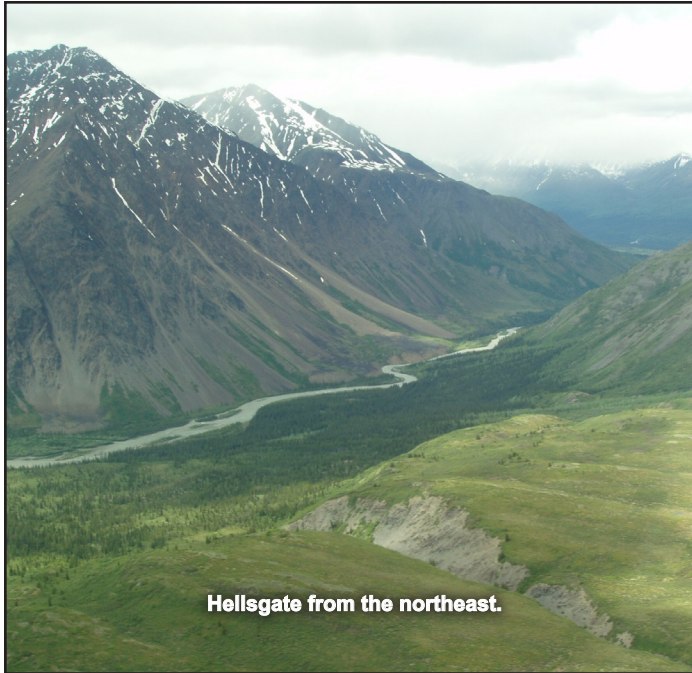
Hellsgate from the northeast.