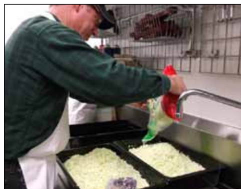
Juneau kitchen staff prepare Alaska Grown cream of Barley and Cole Slaw, purchased with funds from the 'Nutritional Alaskan Foods in Schools' grant from the Alaska DCCED