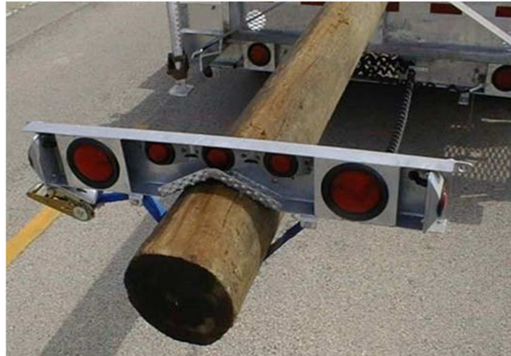
Example of an Extended Light Bar

8.2.2.3 Must have either an extended light bar or a rear pilot/escort vehicle.