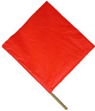
Approved Red Flag