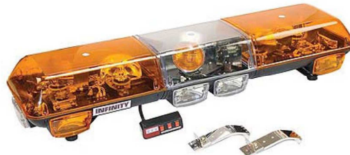
Examples of Approved Amber Beacon and Light Bar