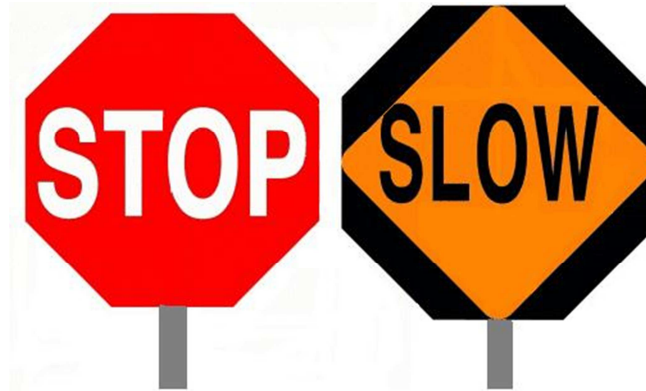
Approved Stop/Slow Paddles