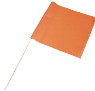
Approved Fluorescent Orange Flag