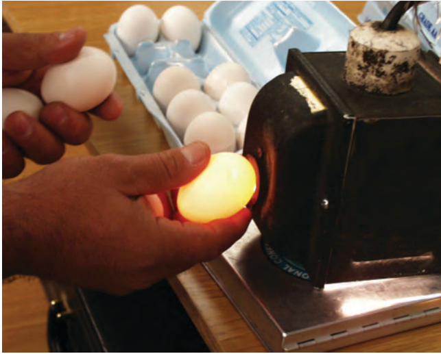
Candling an egg.

Note on candling dark brown eggs: In order to properly candle dark brown eggs, you will need a candling light with a magnifier specifically made for eggs. These can be purchased through a poultry supply company.