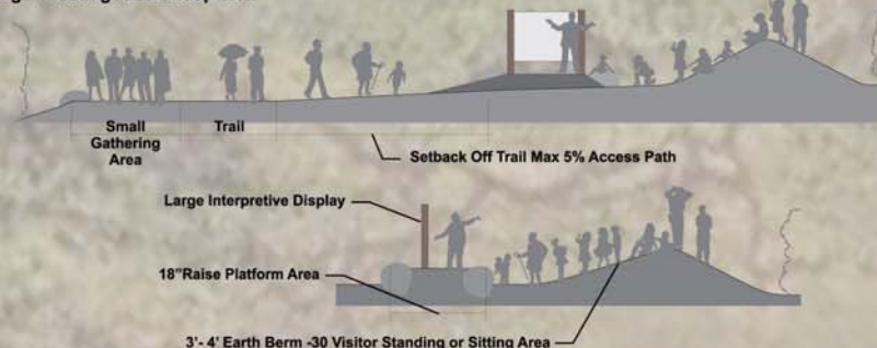
Cross Sections - Small Interpretive Group Area

Chugach Park State Alaska State Parks Bill Evans PLA Landscape Architect Alaska State Parks 907-269-8744 b.evans@alaska.gov Design & Construction 12/28/10