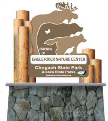
Eagle River Nature Center Signature Entrance Sign

Total Proposed Parking Area Square Footage Projection in 20 years (high) 130 - Total Car & Pickup Parking Spaces 20 - RV & Bus Parking