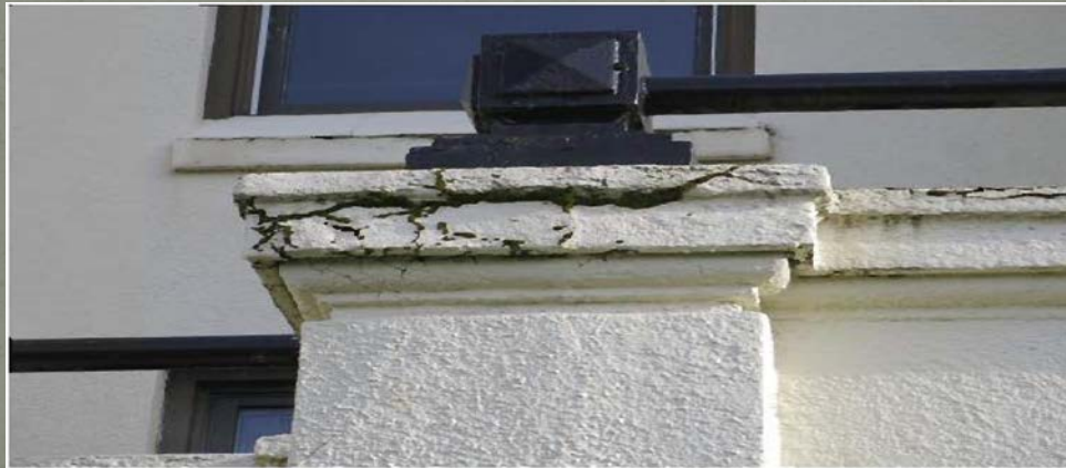
Figure 8. Cracks with organic growth in cementitious parge coat at porch parapet.