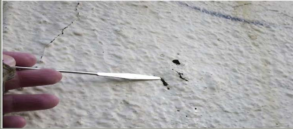
Figure 7. Debonded paint coating with organic growth under coating.