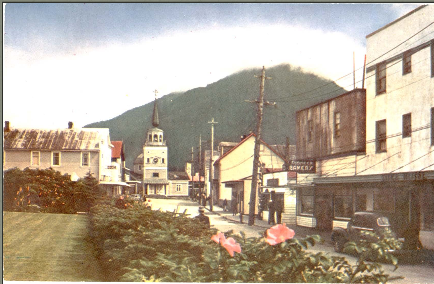
Downtown Sitka circa 1940s