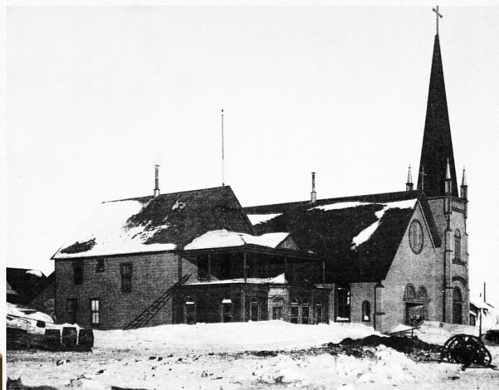
St. Joseph's Residence and Church, Nome, Alaska. No.