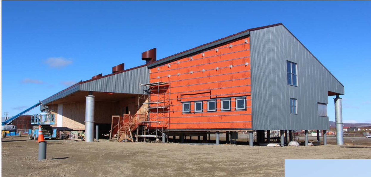
Carrie M. McLain Memorial Museum Richard Foster Building