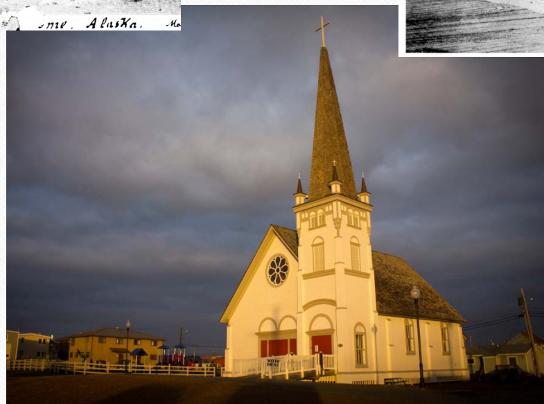
Old St. Joe's