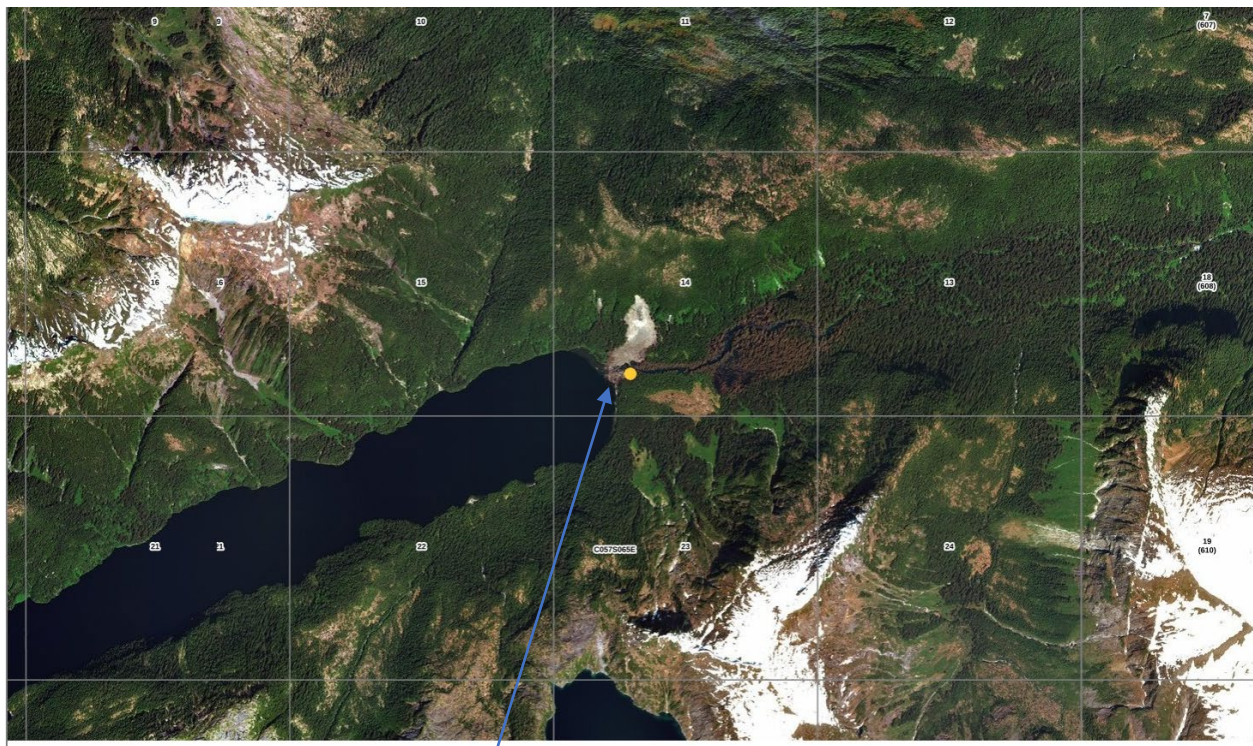
Proposed Luna Lake