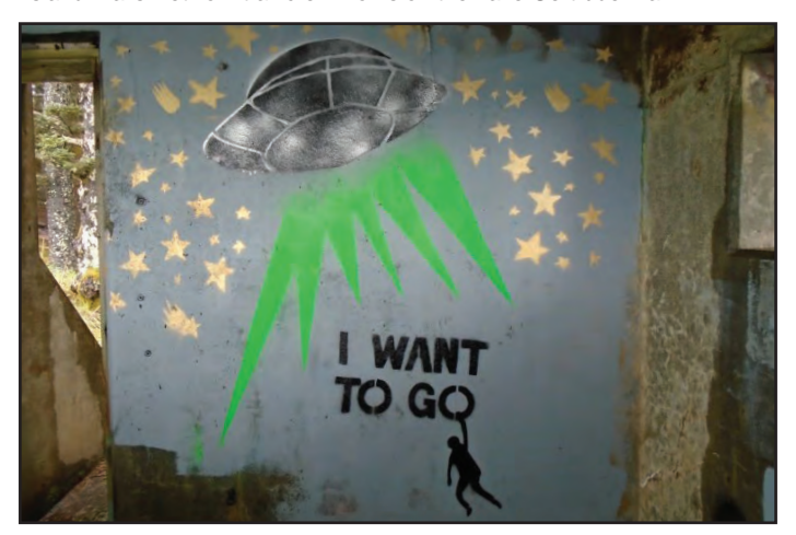
Once again, we have experienced a rash of bunker art this spring at various WWII bunkers at Fort Abercrombie SHP. Kodiak park staff has been out to numerous bunkers this season to paint over the graffiti the historic structures have been tagged with this spring. Pictured is a rare non-obscene example left at the Piedmont Point Distant Electrical Control bunker.