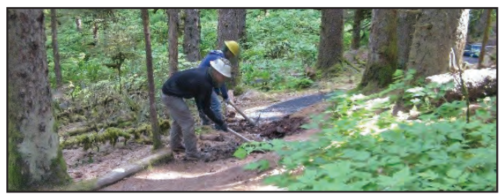
Island Trails Network trail crew works on the Lake Gertrude Trail

It's the season for trail repairs and maintenance, and Fort Abercrombie State Historical Park is no different. This season, just as they have the last two years, Island Trails Network is donating a trail crew to do some much needed work on sections of the trail system in Fort Abercrombie SHP. The ITN trail crew worked on the Lake Gertrude trail last month to repair and harden the tread.