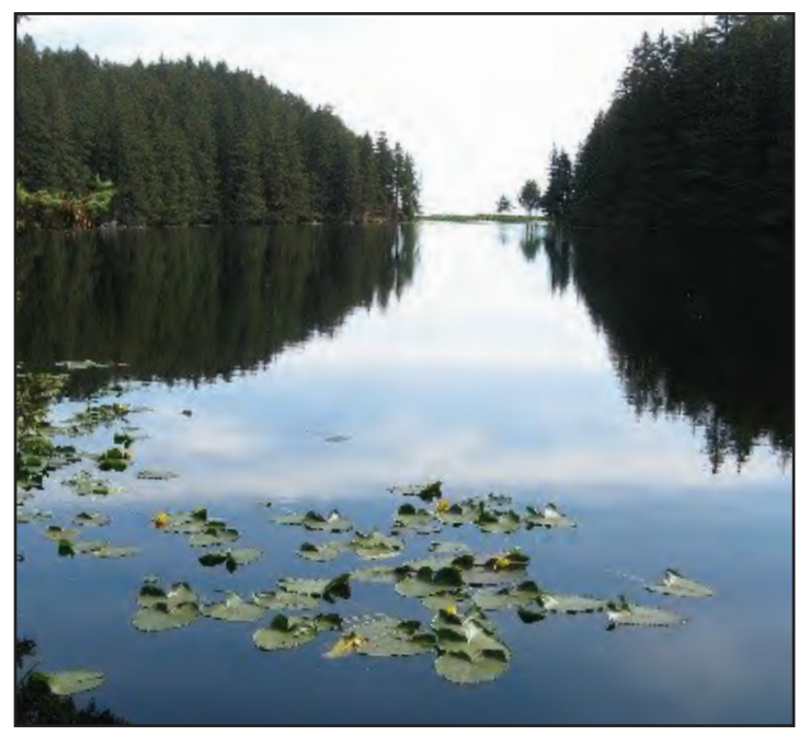
View of Lake Gertrude from the trail