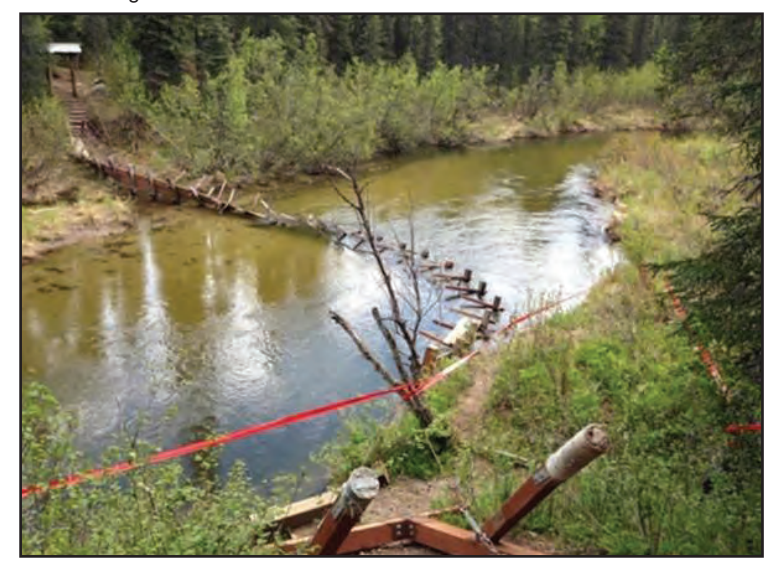
Byers Creek Bridge collapsed this spring.