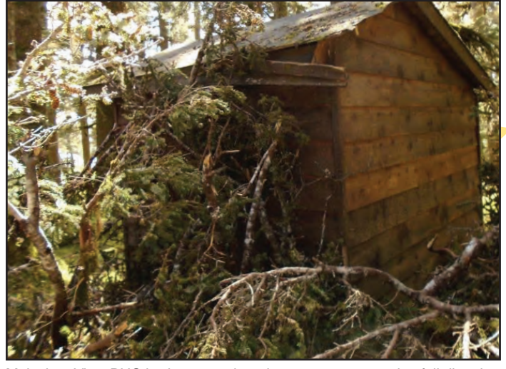
Mulcahey View PUC had a near miss when a tree managed to fall directly between the cabin and the firewood shed, which sustained minor damage from the branches making contact.