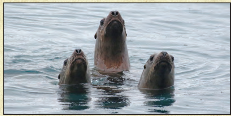
Steller Sea Lion (Eumetopias jubatus)