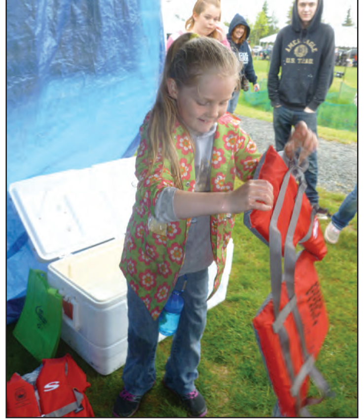
A child tries to put on a life vest while experiencing the effects of cold water.