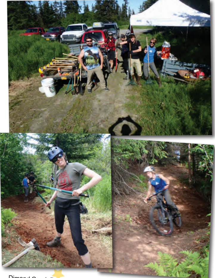
Dimond Creek Demo Trail crew, getting ready for trail work, at work, and riding after finishing the trail work scheduled for the day