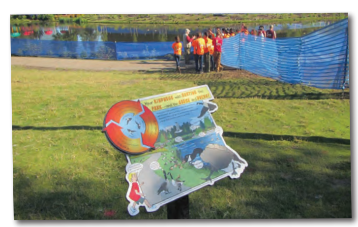
The new interpretive panel on display at Cuddy Family Midtown Park in Anchorage

The interactive interpretive panel with a spinning wheel, described by Ms. Northon as colorful and easy to read, is intended to deter people from feeding the waterfowl in a friendly manner. The panel was installed in four locations in Cuddy Family Midtown Park in late June. In addition to the interpretive panels, a similar message was designed for display on the back of public buses and it was turned into a coloring activity for kids and adults.