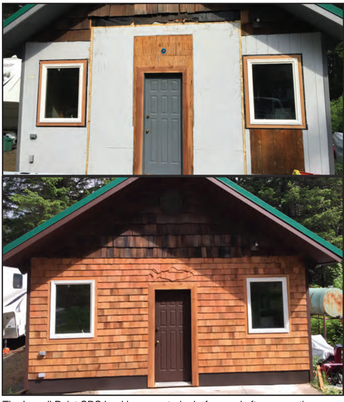
The Lowell Point SRS bunkhouse exterior before and after renovation

An AVTEC construction class replaced the roof this spring with materials purchased by the state, capping off this renovation project.