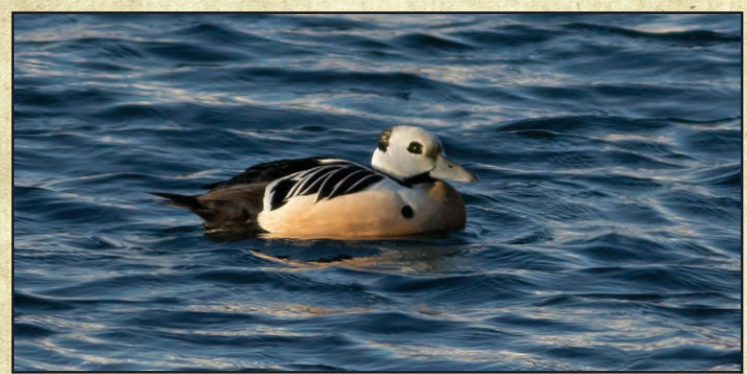
Steller's Eider ( Polysticta stelleri )

As for Kayak Island? The approximate landing site where the Bering Expedition landed on July 20, 1741, is now Kayak Island State Marine Park.