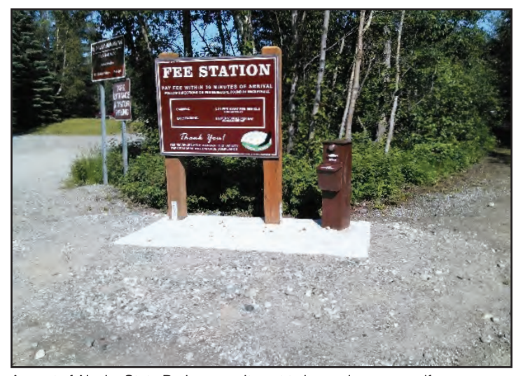
As part of Alaska State Parks commitment to becoming more self-sufficient, day-use parking fees are now being charged at Big Delta State Historical Park and Lower Chatanika State Recreation Area. Northern Area maintenance staff installed this fee station sign at Big Delta State Historical Park this spring.