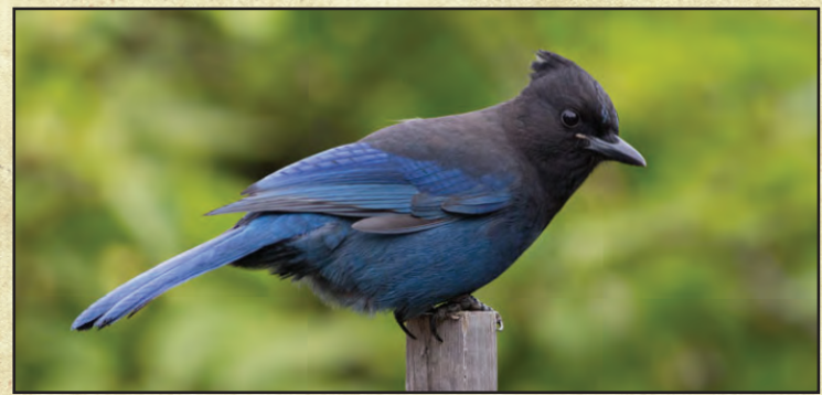
Steller's Jay (Cyanocitta stelleri)