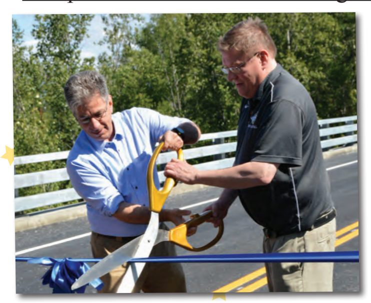
Anchorage Mayor Ethan Berkowitz and Chugiak Sen. Bill Stoltze