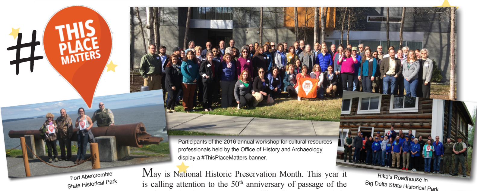
Big Delta State Historical Park