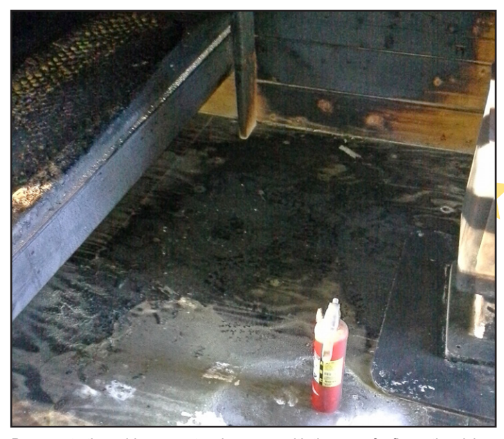
Damage to the cabin was extensive, even with the use of a fire extinguisher.