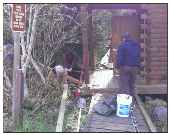
Friends of Kachemak Bay State Park level an outhouse lifted by the freeze thaw cycle.