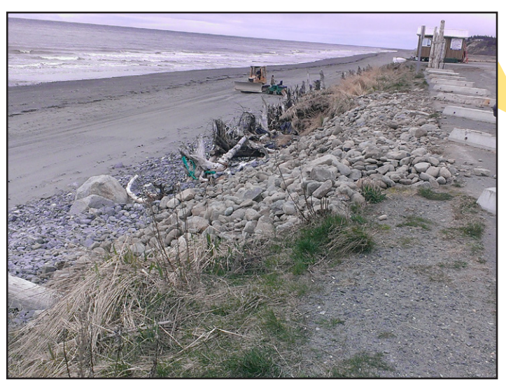
Anchor Point community members pulled together to repair an eroded grade and save the parking area for a local tractor launch from collapse in Anchor River State Recreation Area.