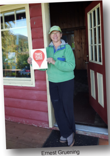
State Historical Park

is calling attention to the 50<sup>th</sup> anniversary of passage of the National Historic Preservation Act. Since Congress passed the law in 1966, thousands of properties have been recognized and rehabilitated, contributing to healthy local economies and education programs. In recognition of the act's 50th anniversary, Governor Bill Walker issued a proclamation declaring May 2016 "Historic Preservation Month in Alaska."