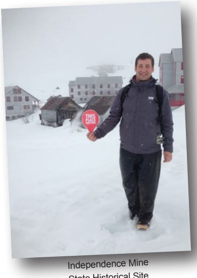
State Historical Site