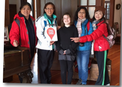
Wickersham State Historic Site