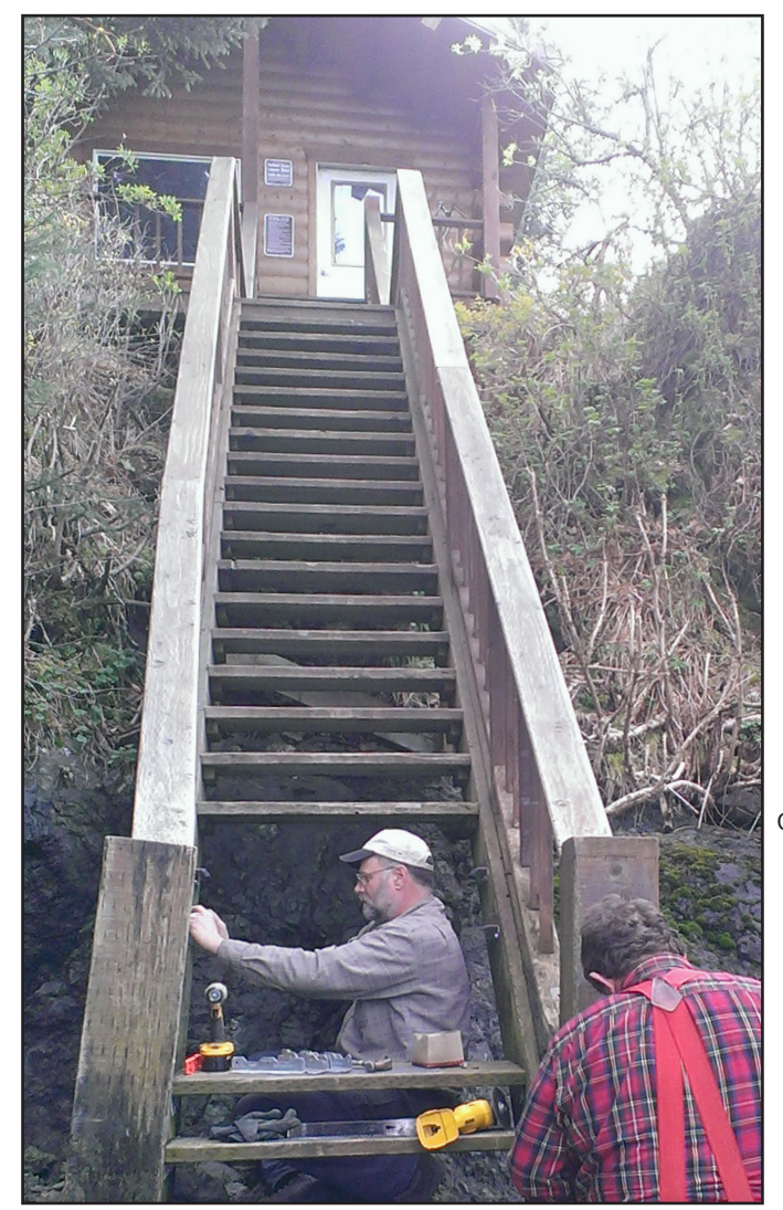
Friends of Kachemak Bay State Park repair old stair treads for the Halibut Cove public-use cabin. Just a few more to go!