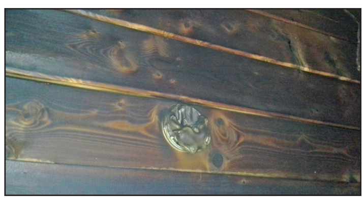
This smoke detector probably would have appreciated a little warning itself.