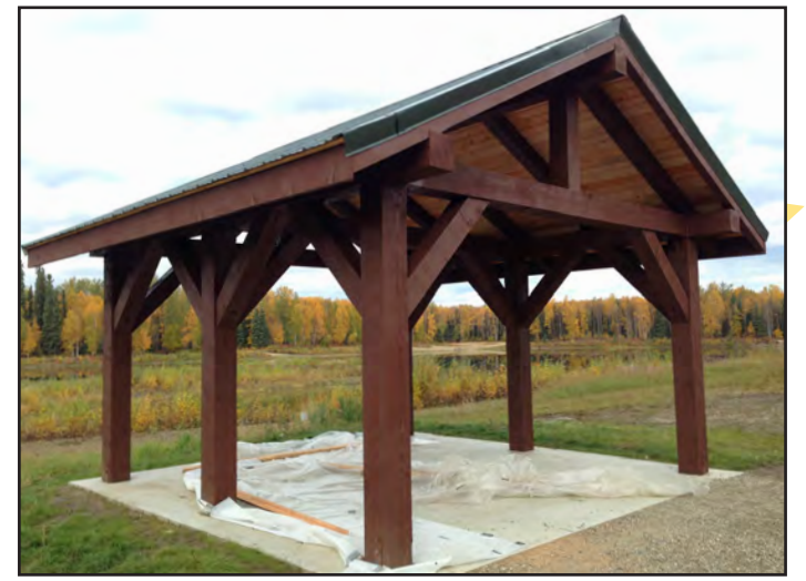
Canon Cogan partnered with Alaska State Parks to complete his Eagle Scout community service project. Canon and Troop 1001 logged over 600 hours of volunteer service constructing a picnic shelter at Olnes Pond in Lower Chatanika River State Recreation Area