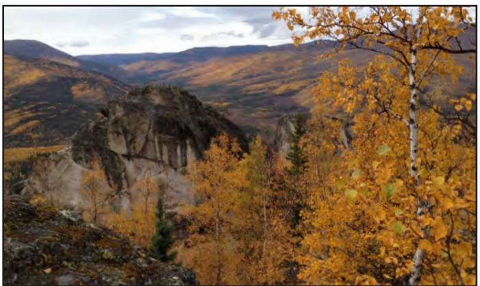
The Northern Area Trail Crew enjoyed great views while working on the Angel Rocks Trail in Chena River State Recreation Area this fall.