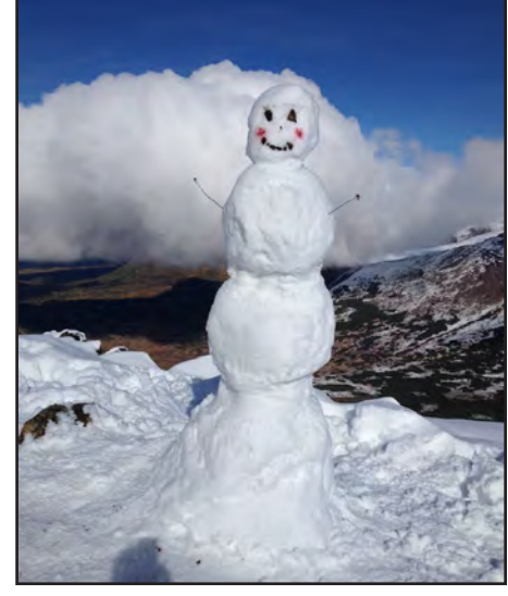
A snowman made an appearance at the top of Peak 3 in Chugach State Park.