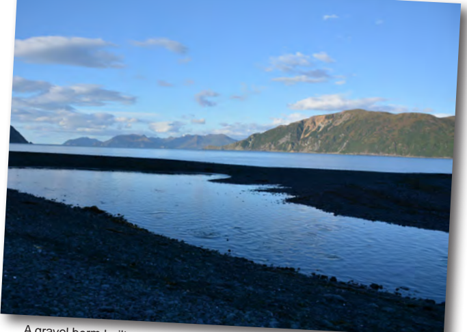
A gravel berm built up naturally at the outlet of Pasagshak River making fish passage difficult, if not impossible, unless there is an exceptionally high tide.