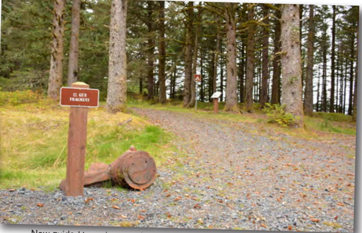
New guided tour signs mark the location of historic features highlighted in the guided walking tour brochure.