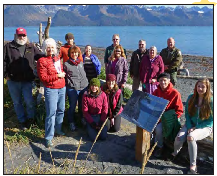
Caines Head Poems in Place dedication attendees

The Poems in Place project is supported by the Rasmuson Foundation, Alaska State Council on the Arts, the Alaska Humanities Forum, the Usibelli Foundation, the Alaska Poetry League, Alaska Center for the Book, and numerous generous individuals.