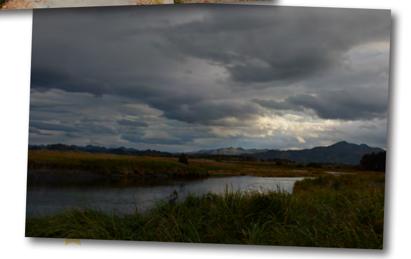
Pasagshak River State Recreation Site