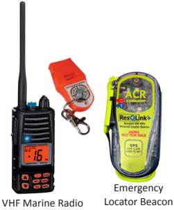
VHF Marine Radio