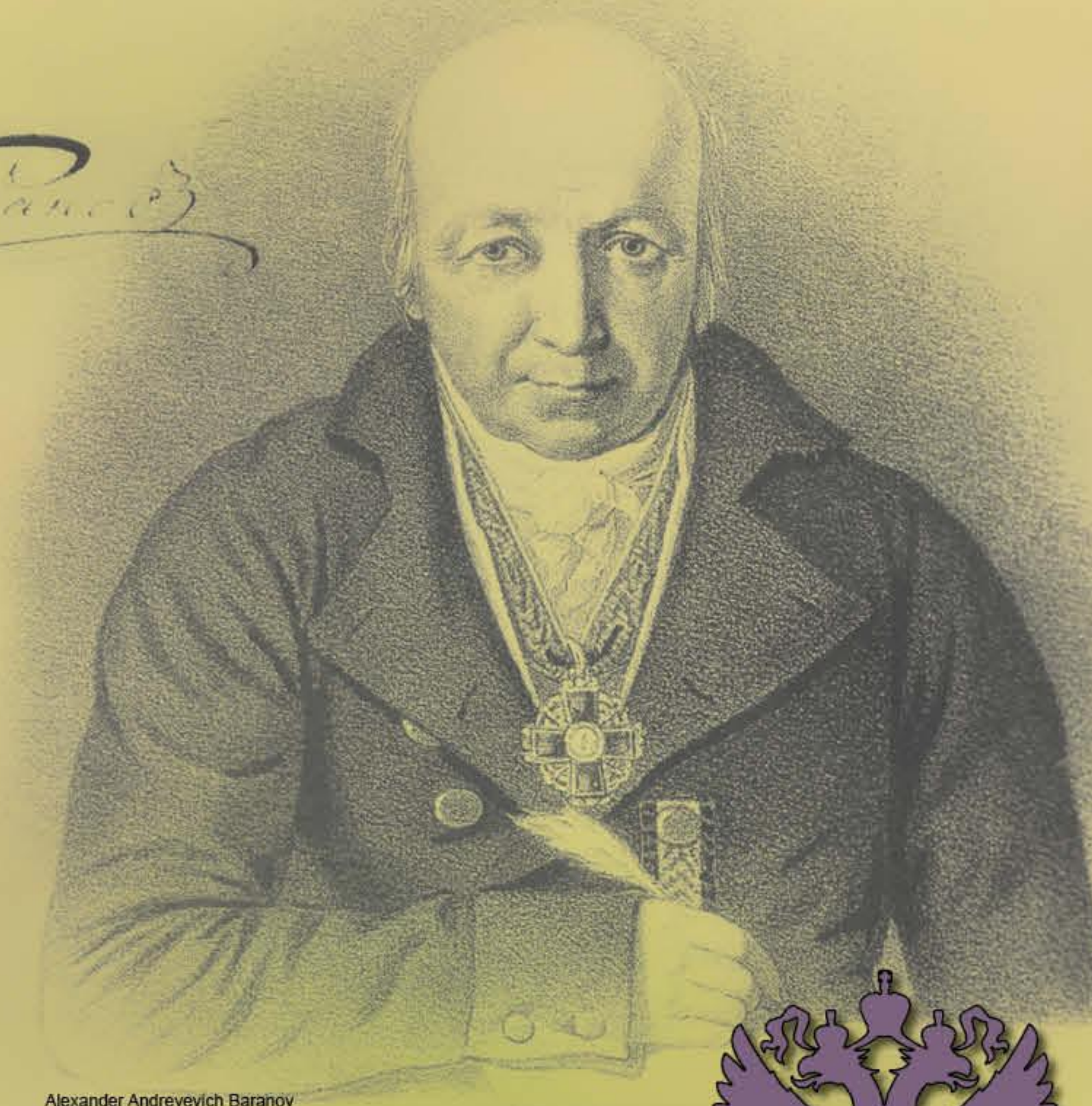
Alexander Andreyevich Baranov