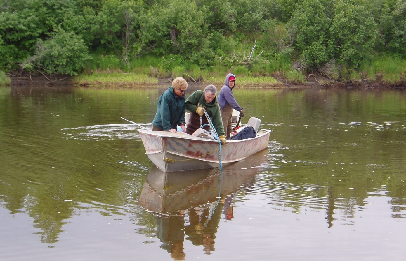
Gage Site Looking from Right Bank to Left Bank, 6/22/04