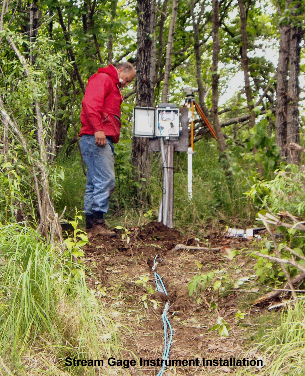
Stream Gage Instrument Installation