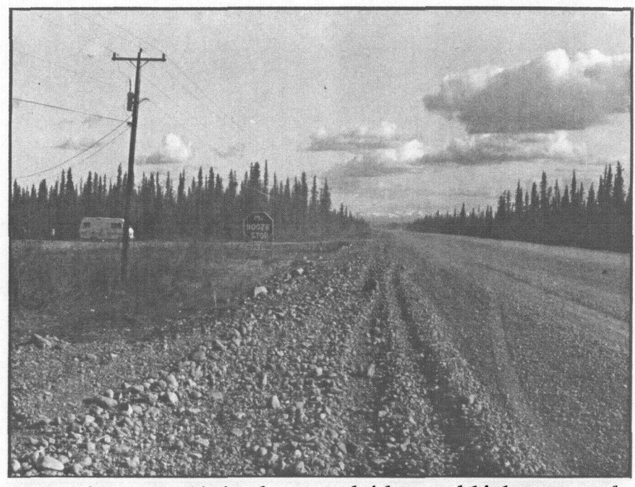
Many views are limited to roadside establishments and right of way vegetation due to the flat terrain and dense spruce forest.