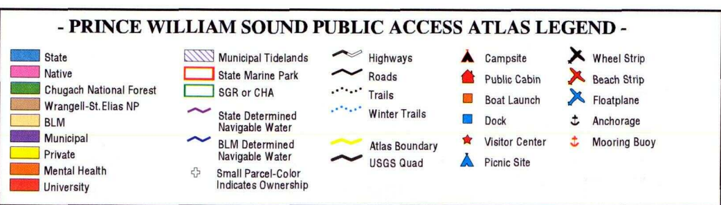
USGS Quadrangles Cordova B-1 & B-2