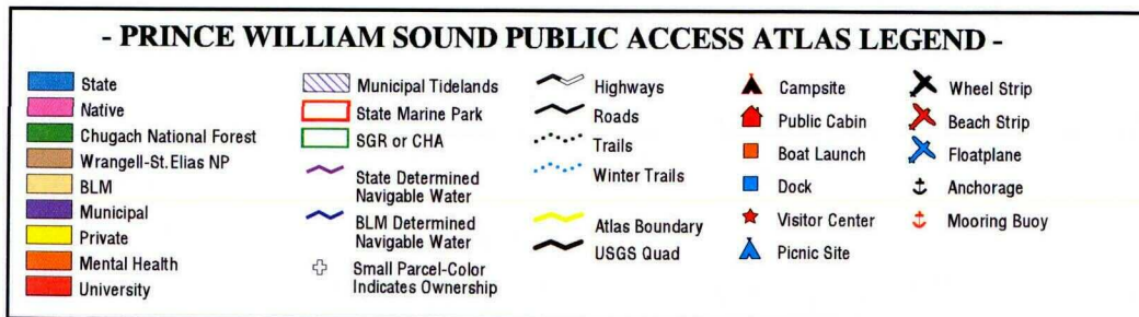
USGS Quadrangles Anchorage B-1 & B-2