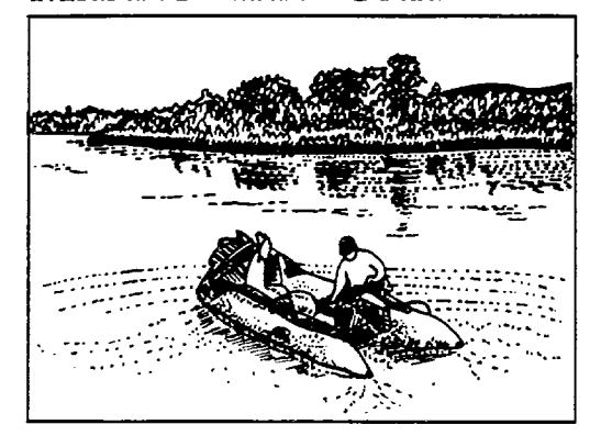
Chapter 3 LAND MANAGEMENT POLICIES FOR EACH MANAGEMENT UNIT

If you want to know how the plan affects a particular place -- for example, a parcel on the Goodpaster River -- turn to Chapter 3. The planning area is divided into 8 subregions. Subregions are shown on the index map on page 3-1. Use this index map to find which subregion your place is in. Then use the maps at the end of that subregion to find the management unit. Then turn to that management unit in Chapter 3. For example, you'll find the Goodpaster River in Subregion 7, Management Unit 7D, on page 3-215.